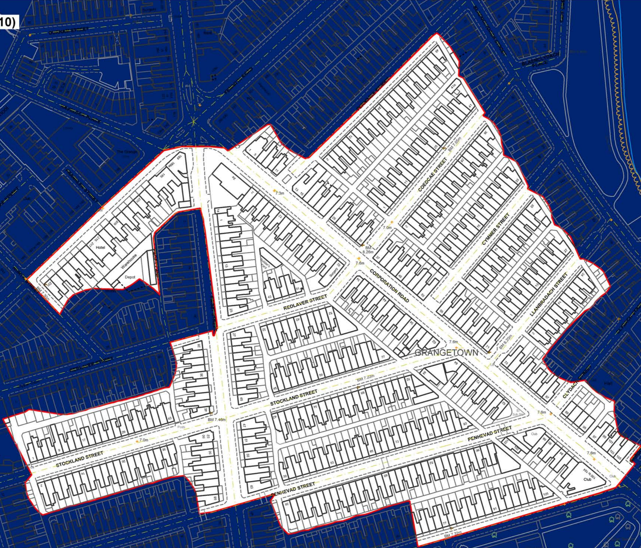
Map derived from O.S. Landline