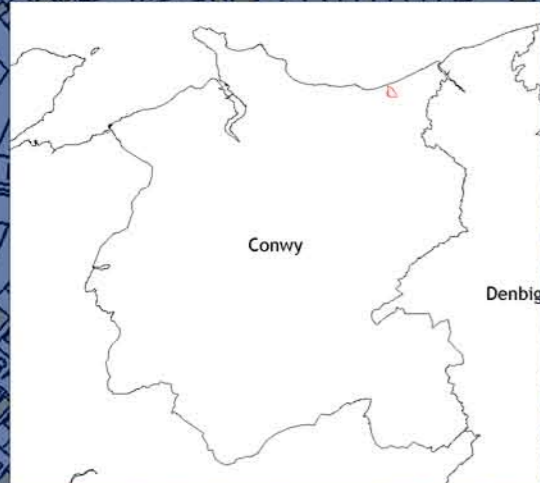
Map derived from O.S. 10k Landplan