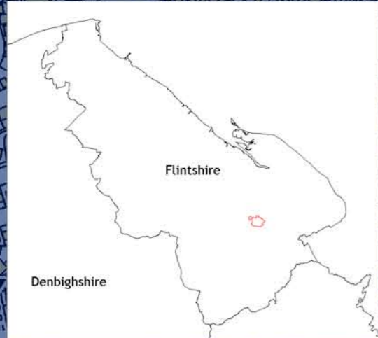
Map derived from O.S. 10k Landplan