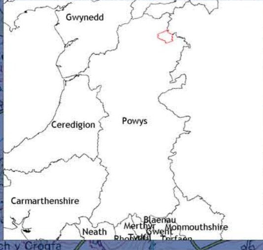
Map derived from O.S. 50k Raster