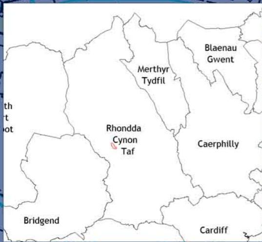
Map derived from O.S. 10k Landplan