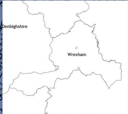
Map derived from O.S. 10k Landplan