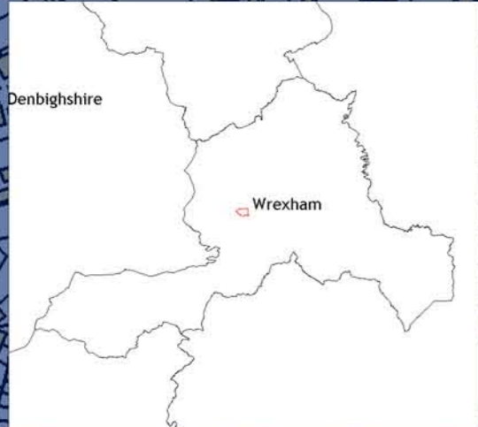
Map derived from O.S. 10k Landplan