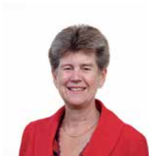
Jane Hutt AM

We want to make sure our ideas are right. Please tell us what you think by reading this document. And then filling in the response form.