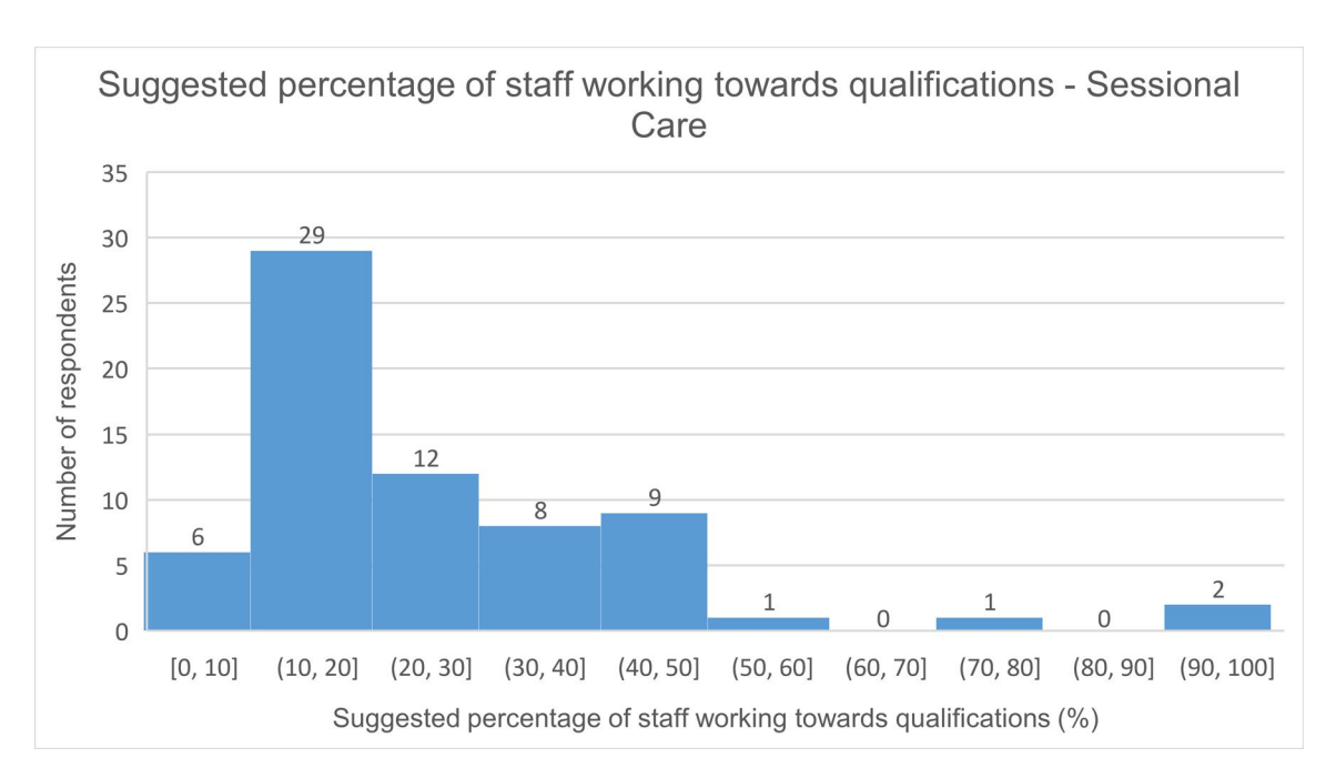
Figure 1: Suggested percentage of staff working towards qualifications - Sessional Care

58 respondents responded to this question in relation to Open Access Play . 139 respondents left the question blank. Of those who responded, six indicated that no staff working towards qualifications should be included in ratios. Of those who indicated a percentage above 0, responses were as follows: