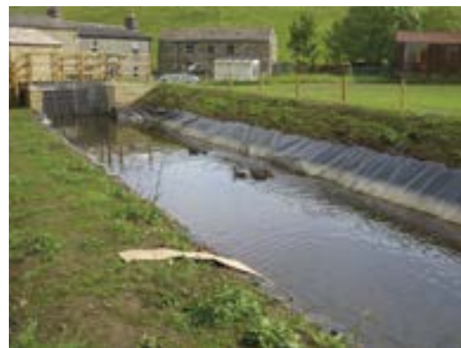
Leat channel and inlet debris screen to screw

The River Bain hydro scheme has been operational since May 2011 and is estimated to result in carbon dioxide emissions savings of approximately 80 tonnes per annum, with a total of around 3,000 tonnes over the expected 40 year lifetime of the scheme. The turbine operates at an efficiency of approximately 75% “water to wire” on average across all operating conditions and will run about 85% of the time in winter and about 45% of the time in summer, depending on the amounts of rainfall driving river level. Maintenance downtime is estimated at 2% of the year, around 7 days, and scheduled where possible into the summer to avoid lost productivity.