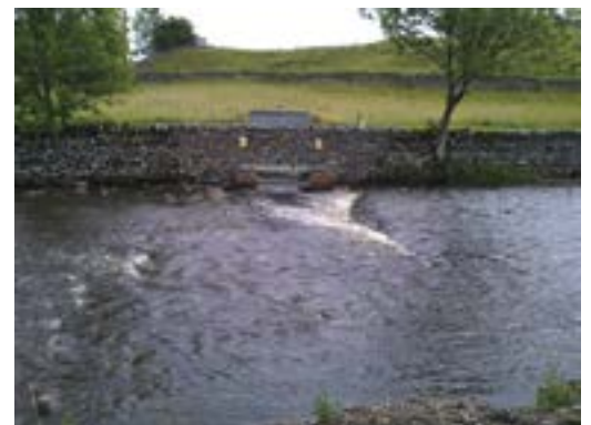
Intake to leat channel for turbine

The risk of fish mortality can be a major barrier to development of hydro schemes and close liaison with the relevant Environmental authority (the Environment Agency in England and Wales) is necessary to incorporate mitigation measures such as setting appropriate abstraction license conditions or building fish passes.