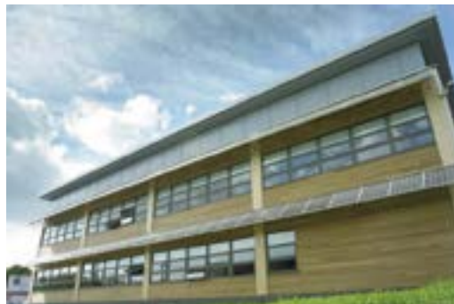
Brise soleil on south facade of building