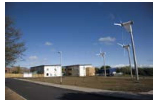
Lion House offices with wind turbines in foreground