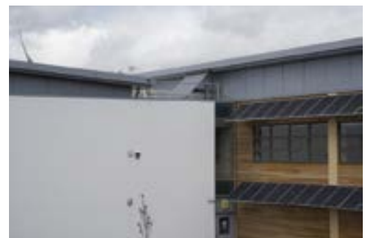
BIPV system at Lion House

Finally, integrating the PV array into an external solar shading system has advantages over other BIPV systems such as glazing replacement, which can result in unwanted heat transfer from the PV array to the indoor environment during the summer.