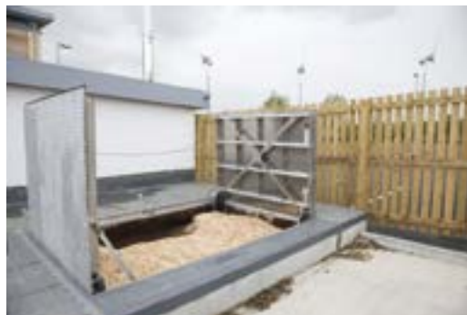
Woodchip fuel storage area

The carbon emissions for the building taking into account the selected renewable and low carbon technologies were anticipated to be 48% less than the Building Regulations Part L 2006. In order to achieve better than 'carbon neutral' status, three 15 kW wind turbines were selected, generating a further 60 MWh of electricity per year and thus achieving "true zero carbon" as defined by BREEAM.