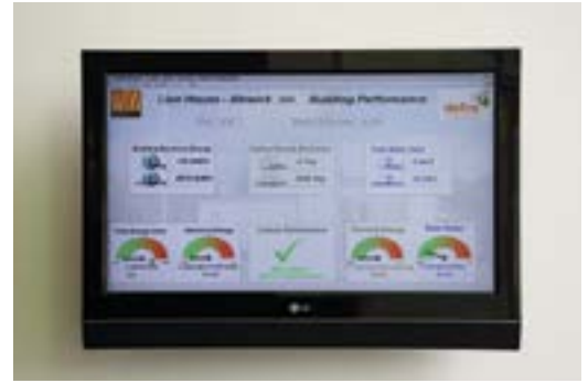
Live monitoring display of technology performance

The Lion House development was primarily an experiment to identify how different technologies could work together. The chosen combination of technologies for this development are theoretically