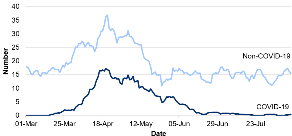
Chart 2: Deaths notified to Care Inspectorate Wales of care home residents by cause of death and day of notification (7 day rolling average), 1 March to 14 August 2020