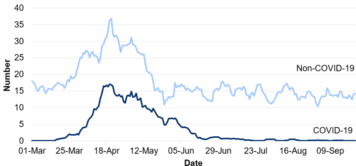
Chart 2: Deaths notified to Care Inspectorate Wales of care home residents by cause of death and day of notification (7 day rolling average), 1 March to 25 September 2020