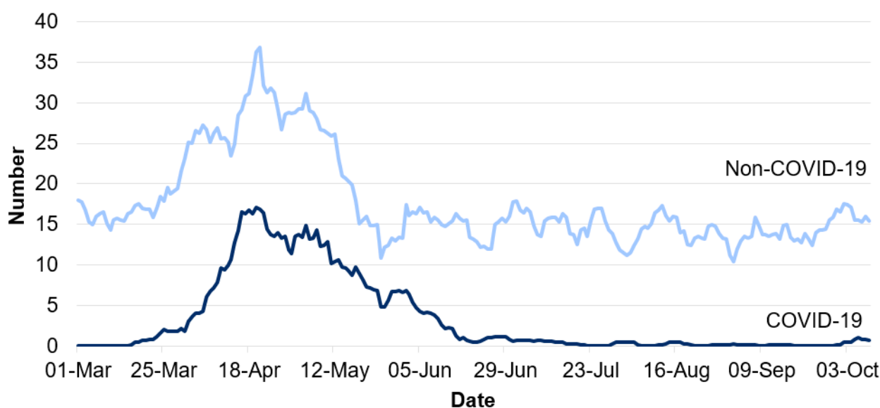
Chart 2: Deaths notified to Care Inspectorate Wales of care home residents by cause of death and day of notification (7 day rolling average), 1 March to 9 October 2020