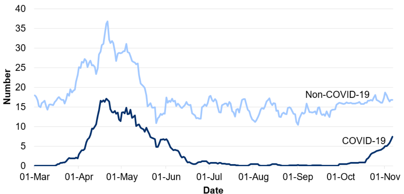
Chart 2: Deaths notified to Care Inspectorate Wales of care home residents by cause of death and day of notification (7 day rolling average), 1 March to 6 November 2020