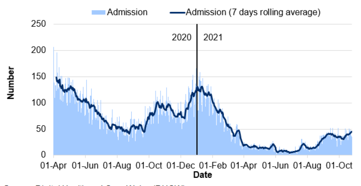
Chart 1: Patients admitted to hospital as suspected or confirmed with COVID-19, from 1 April 2020