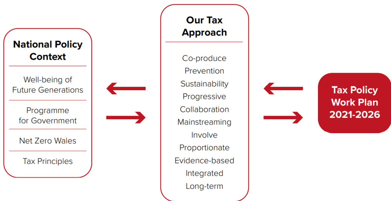
Figure 1: How tax policy supports our strategic objectives