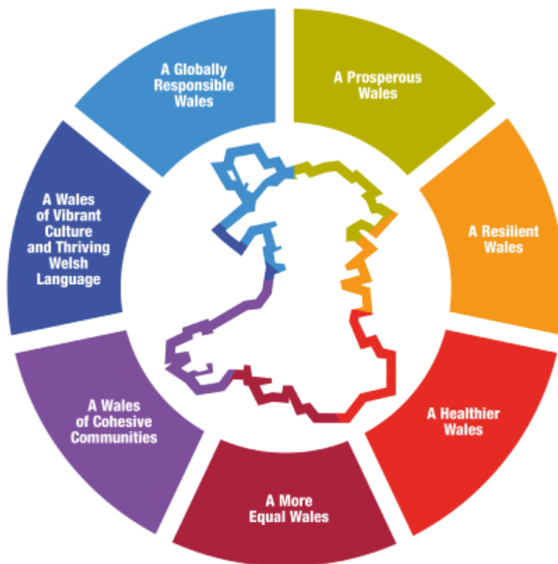
Figure 2: Our 7 connected well-being goals for Wales