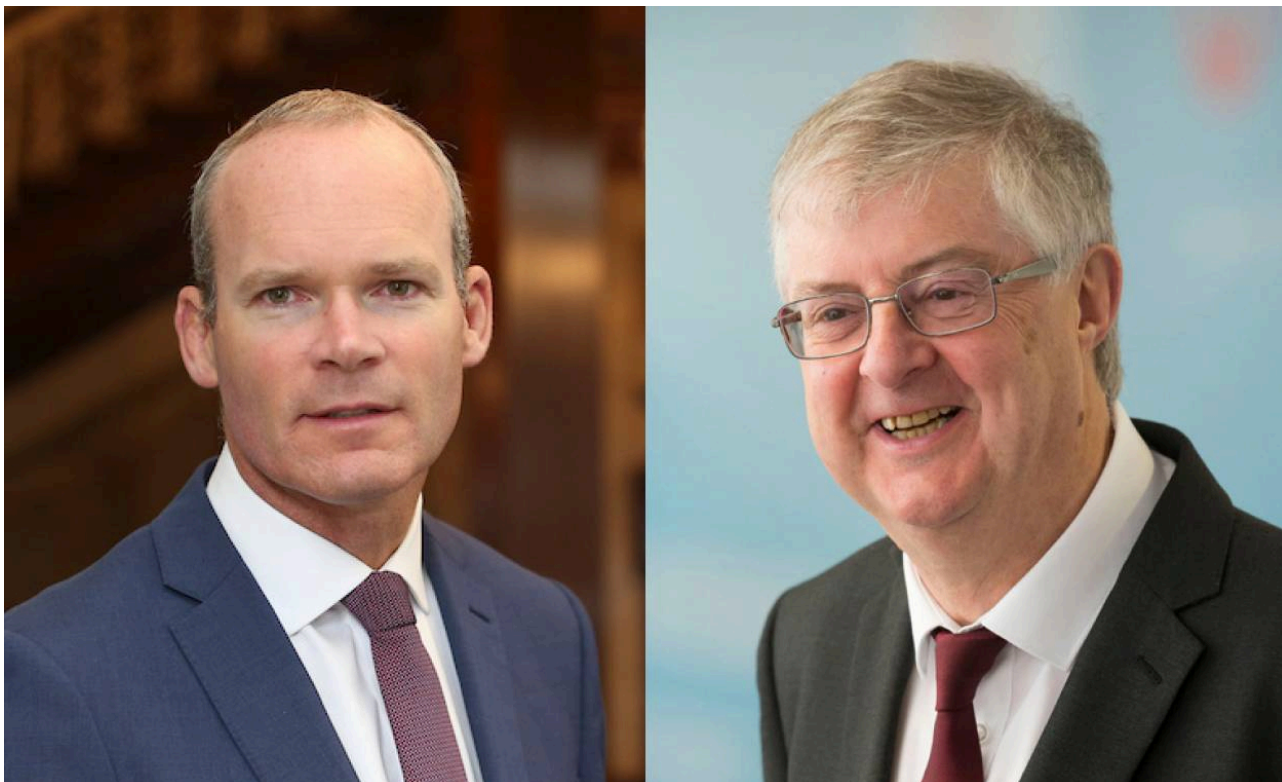
Simon Coveney TD, Minister for Foreign Affairs and Minister for Defence Mark Drakeford MS, First Minister of Wales

Wales and Ireland are the closest of neighbours. Our strong and positive relationship is built on age-old connections and a deep cultural understanding. It is also a modern and vibrant relationship, made up of links and collaboration