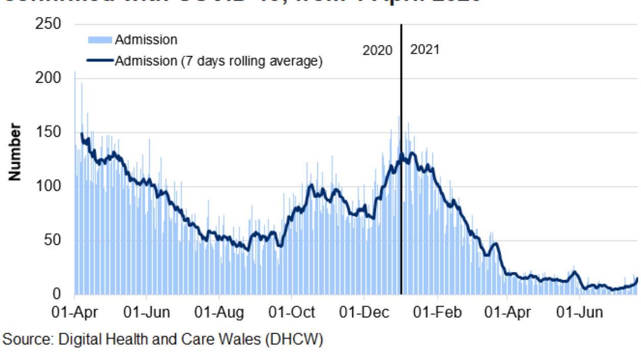
Chart 1: Patients admitted to hospital as suspected or confirmed with COVID-19, from 1 April 2020

Patients admitted to hospital as suspected or confirmed with COVID-19, from 1 April 2020 (MS Excel)