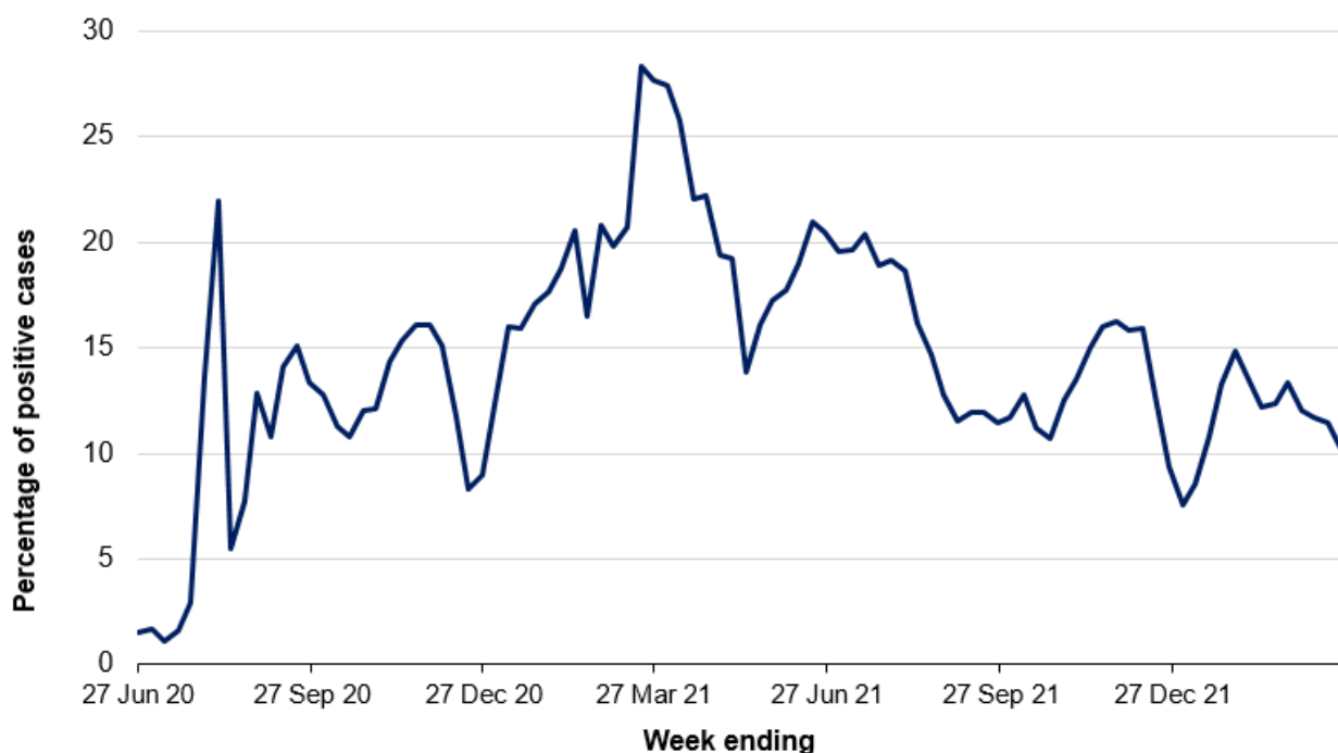
Chart 3: Percentage of positive cases who had been close contacts in the previous 7 days, up to 26 March 2022