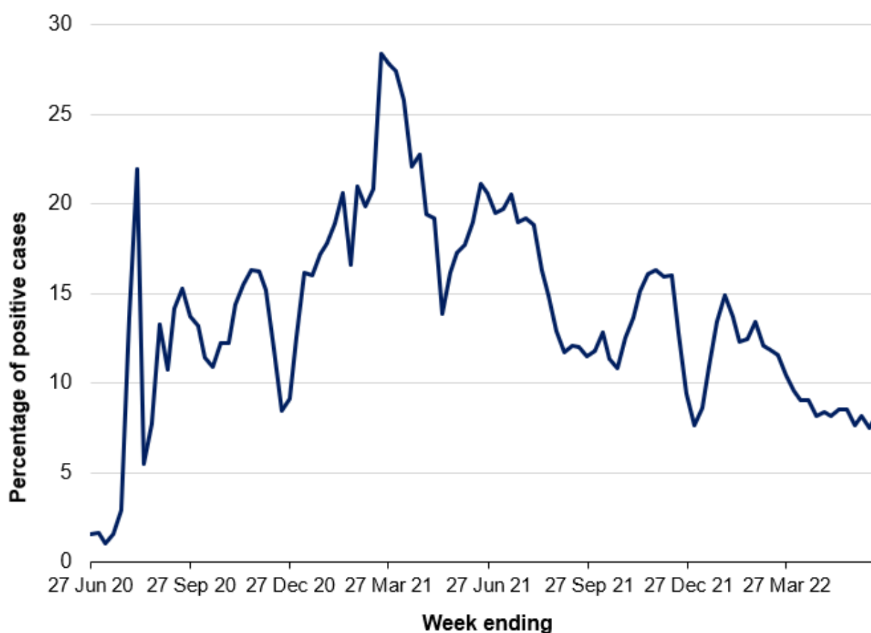
Chart 3: Percentage of positive cases who had been close contacts in the previous 7 days, up to 18 June 2022