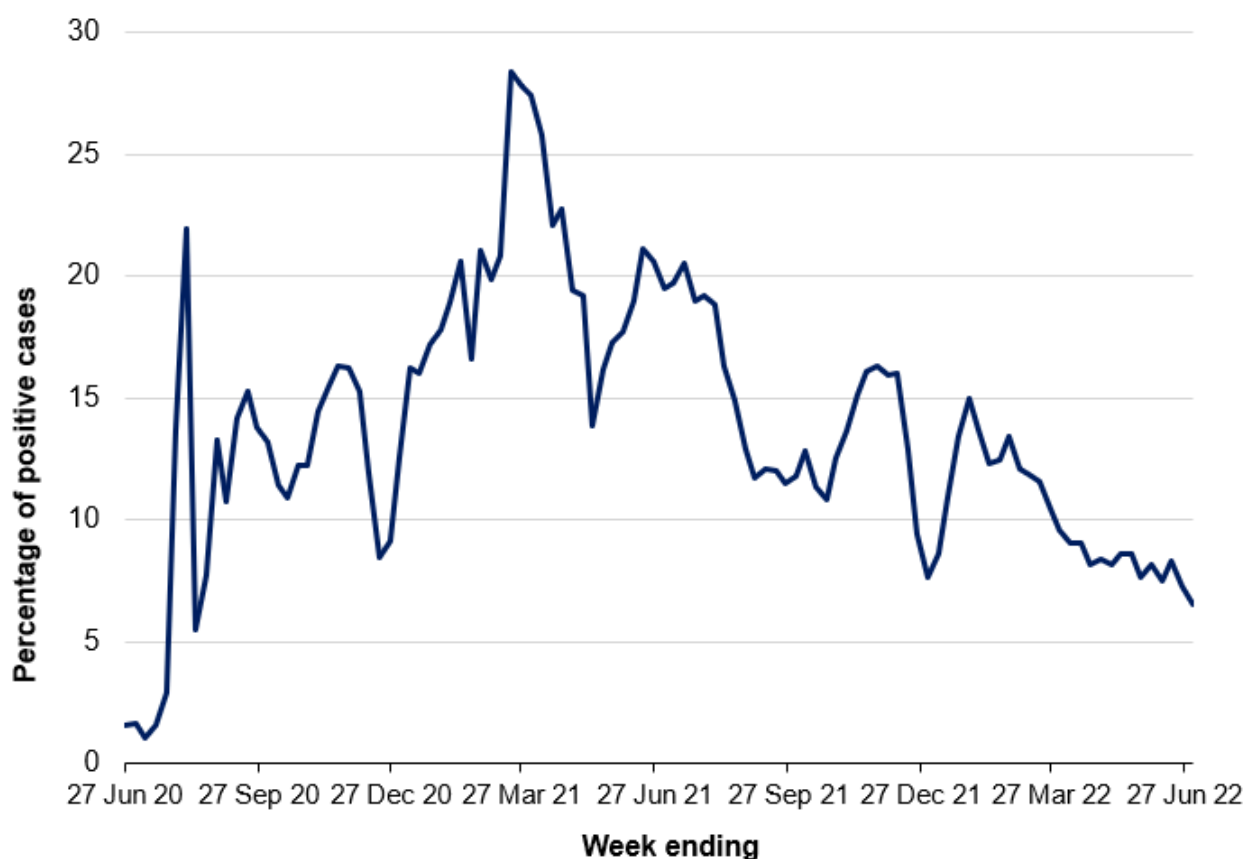
Chart 3: Percentage of positive cases who had been close contacts in the previous 7 days, up to 2 July 2022