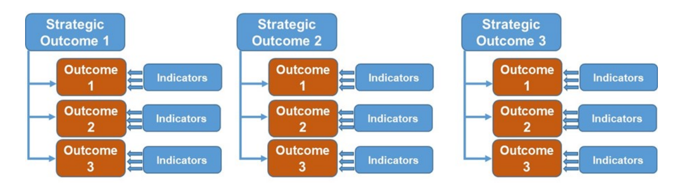
Diagram 2: Conceptual approach to developing the Ending Homelessness Outcomes Framework

This approach is illustrated in Diagram 2 .