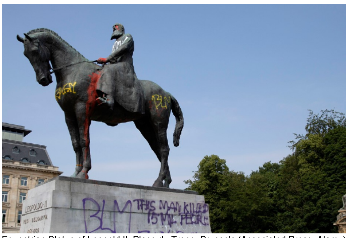
Equestrian Statue of Leopold II, Place du Trone, Brussels (Associated Press, Alamy).

After Denbigh-born explorer Henry Morton Stanley gained access to the interior of the Congo, a large area was bought under the rule of King Leopold II of Belgium in 1885. Locals were treated brutally on rubber plantations and even the