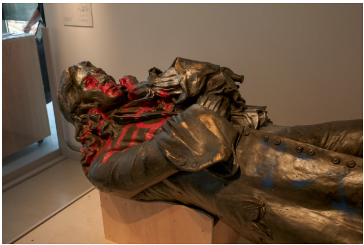
Statue of Edward Colston on display at the M-Shed Museum, Bristol

Respondent quoted in The Colston Statue: What Next? by the 'We are Bristol' History Commission