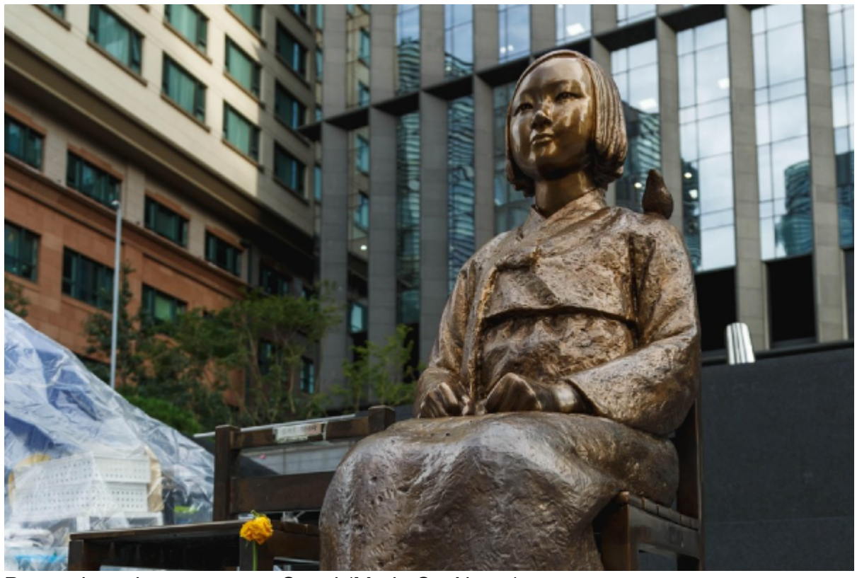
Pyeonghwaui sonyeosang, Seoul

The 'Pyeonghwaui sonyeosang' (평화의 소녀상, English: 'Statue of a Girl for