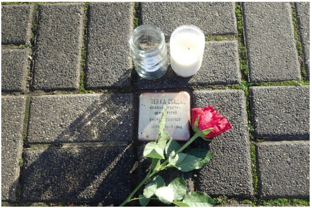
Stolperstein commemorating the actress Terka Csillag outside Bochum Theatre in Bochum, Germany.(Gisbert).

There are large memorials to the Holocaust all over the world, often located in the centres of capital cities or dedicated areas. The Stolpersteine (German: Stumbling stones) are a memorial to the victims on a different scale. They are 10cm concrete cubes with a brass plate bearing an inscription in one local official language. The short inscriptions vary in format but typically begin with 'Here lived' followed by the victim's name, date of birth and fate: internment, suicide, exile or, in the vast majority of cases, deportation and murder. The stones are set into the pavement outside the last freely chosen address of the person commemorated. The research for Stolpersteine is often done by schools and local history groups.