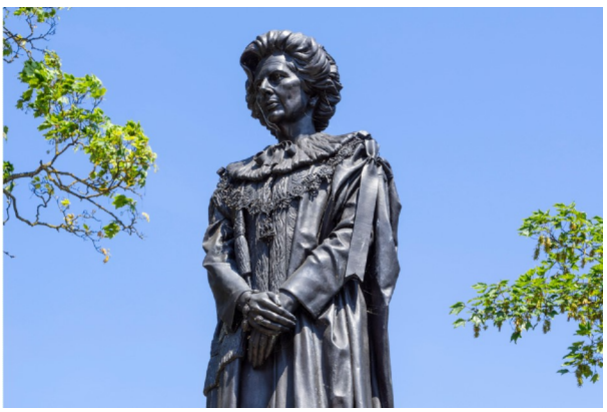
Statue of Margaret Thatcher in Grantham, England

Margaret Thatcher was a historically important figure, but people find it hard to view her objectively. As prime minister, between 1979 and 1990, she was both idolised and detested. She presided over unemployment and industrial strife, including a deeply divisive miners' strike. Nevertheless, she was Britain's first female prime minister; she won three general elections, she led the country during the Falklands Conflict and she was recognised worldwide as the 'Iron Lady'.