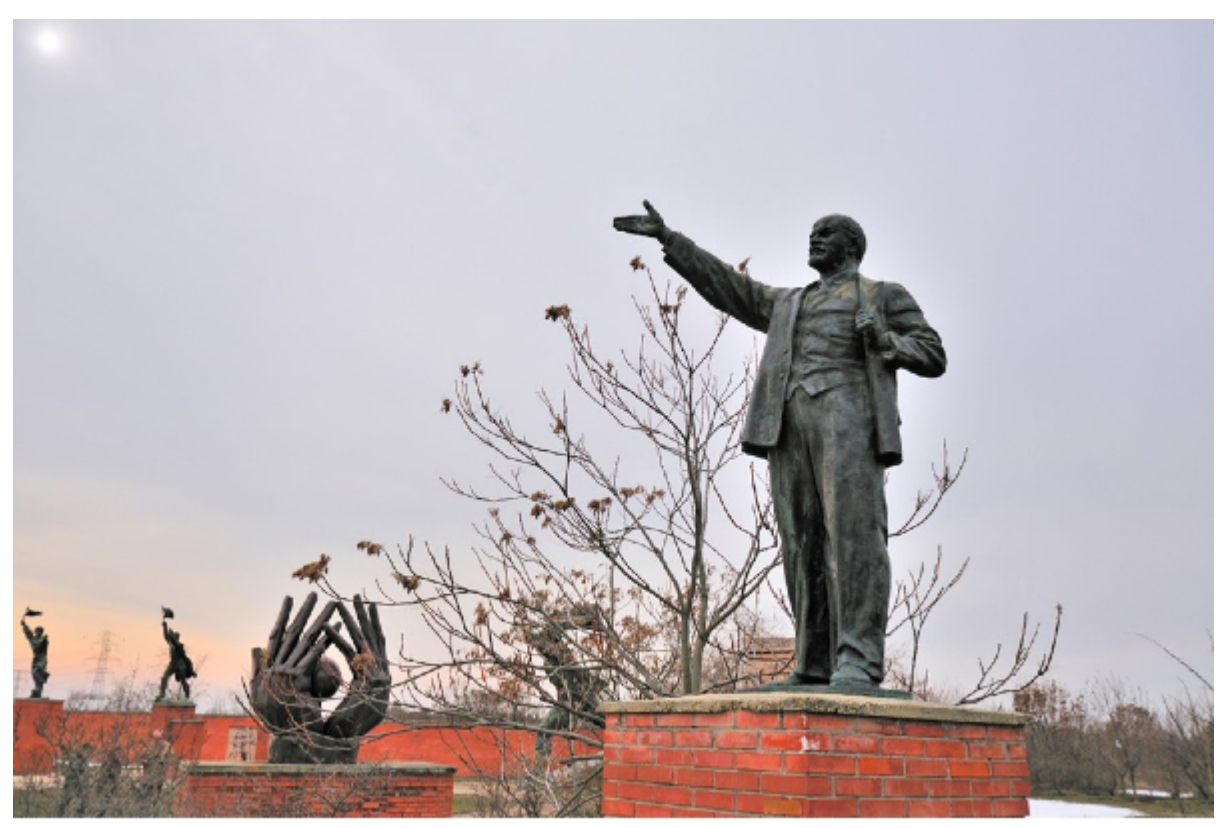
Lenin and other sculptures at Szoborpark, Budapest.

In several countries, a response to statues that do not align with current values has been to move them into dedicated parks.