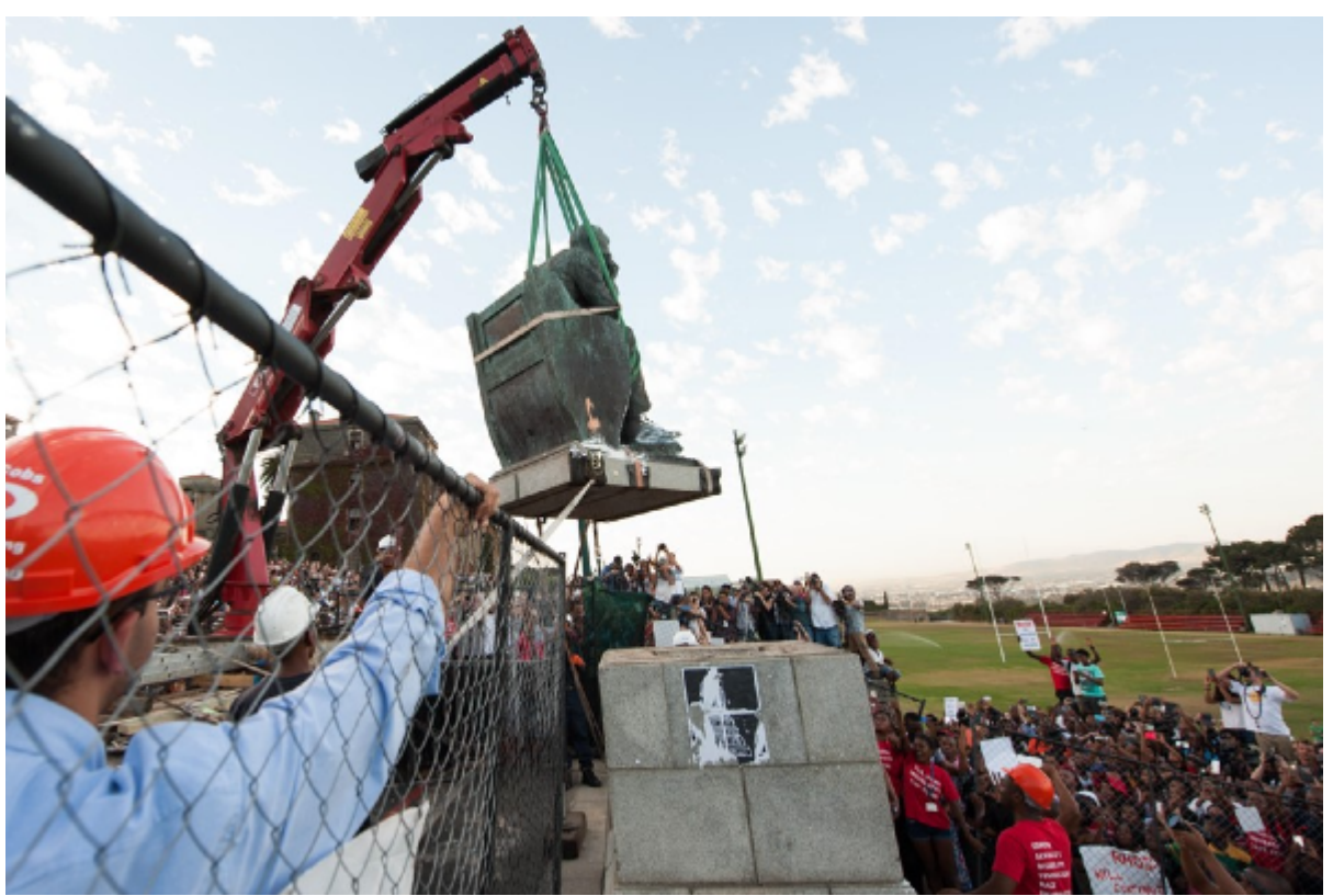
Statue of Cecil Rhodes being moved from the University of Cape Town.

On 9 March 2015 a statue of Cecil Rhodes on the campus of the University of