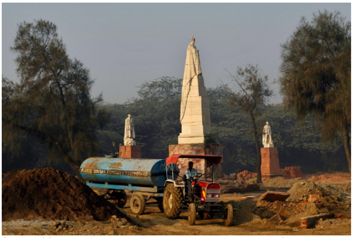
Statues of George V and two Viceroys during maintenance work at Coronation Park, Delhi.

Communism, but about the fall of Communism'. Some of the exhibits still bear graffiti from around 1989, saying, for example, 'Russians, go home!' and some are visibly damaged. The centrepiece is 'Stalin's Boots', a replica of the city's monumental sculpture of Stalin as it appeared after protestors had torn it down during the attempted revolution of 1956, leaving only the Soviet leader's boots upstanding. The park has been viewed humorously by foreign tourists who make up the majority of visitors.