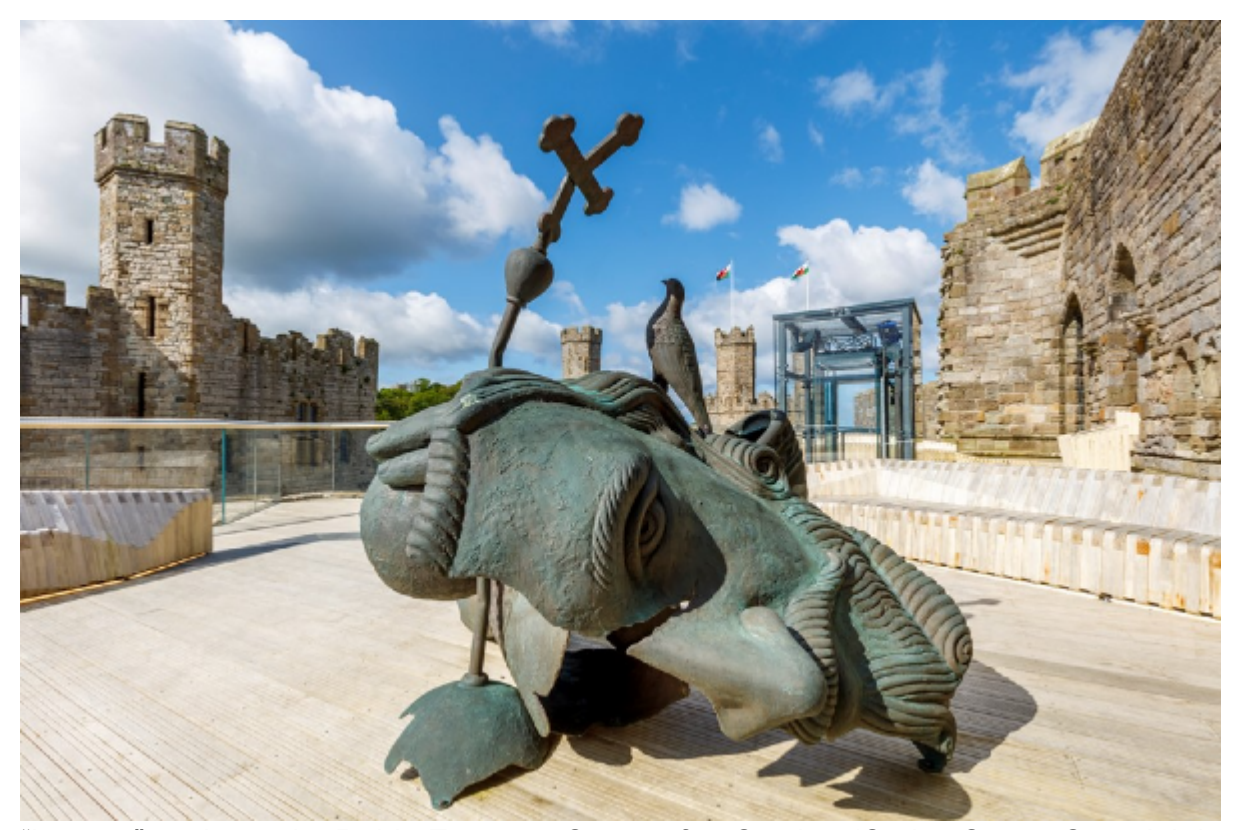
"Legacy" sculpture by Rubin Eynon at Caernarfon Castle.

The Castles and Town Walls of Edward I in Caernarfon, Conwy, Harlech and Beaumaris are a World Heritage Site managed by Cadw on behalf of the Welsh Ministers. Described by UNESCO as "a masterpiece of human creative genius" they are important attractions for the Welsh tourism industry. Castell Caernarfon alone receives 195,000 visitors per year, many from England.