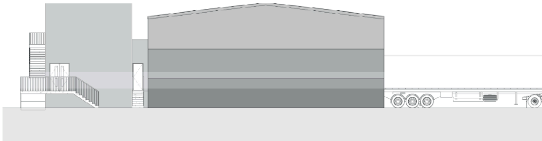
Produce Inspection Bay - Side Elevation 2