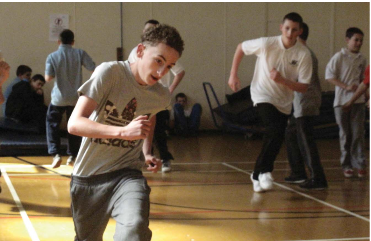
Willows High School - a Rubicon Dance project