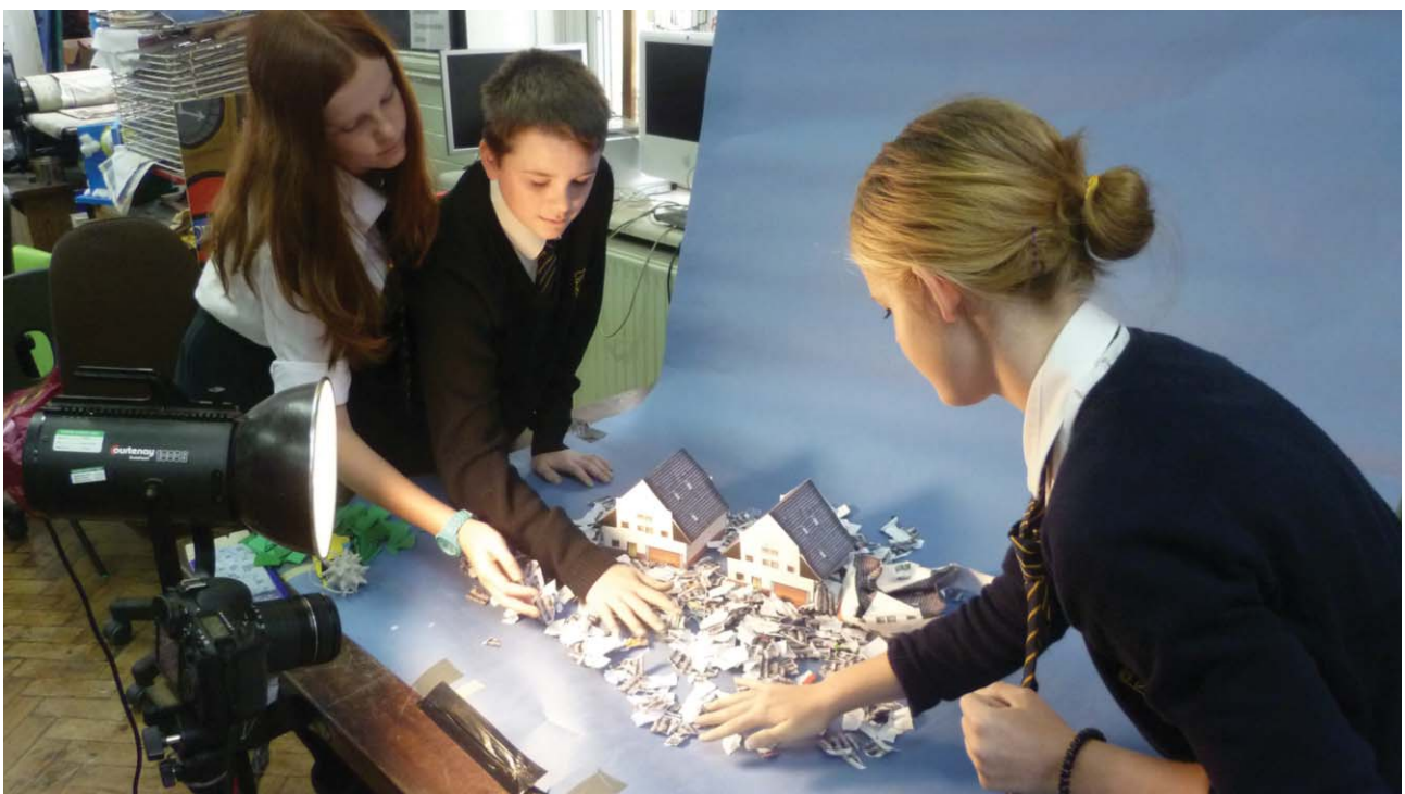
Ffotogallery animation workshop, Stanwell School, Penarth

"Good teachers and many high performing schools are already doing what we are recommending. We want teachers to have more freedom to use their own creative and professional skills. Greater freedom for teachers in the classroom will help to promote creative teaching and this is essential to promote creative learning" .