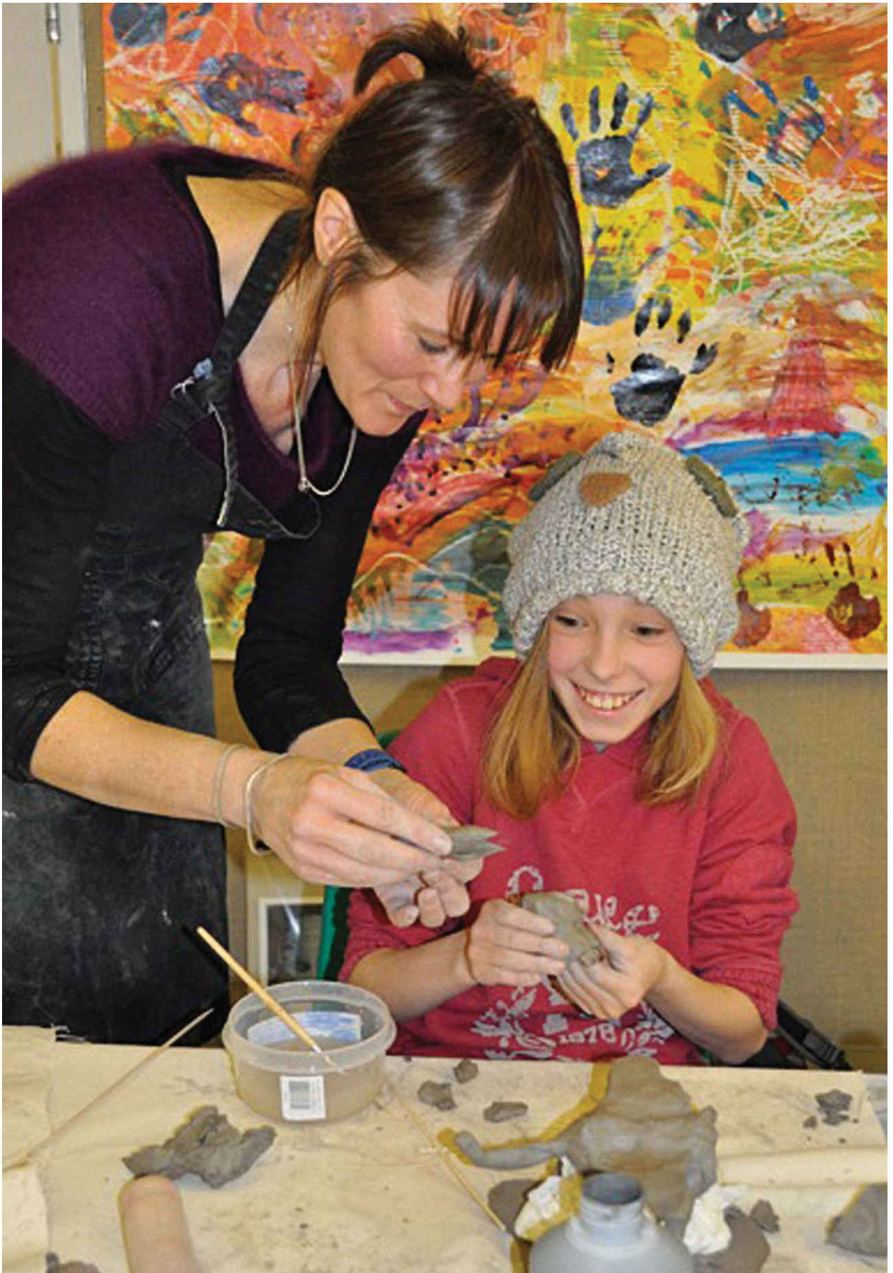
Criw Celf, Ruthin Craft Centre