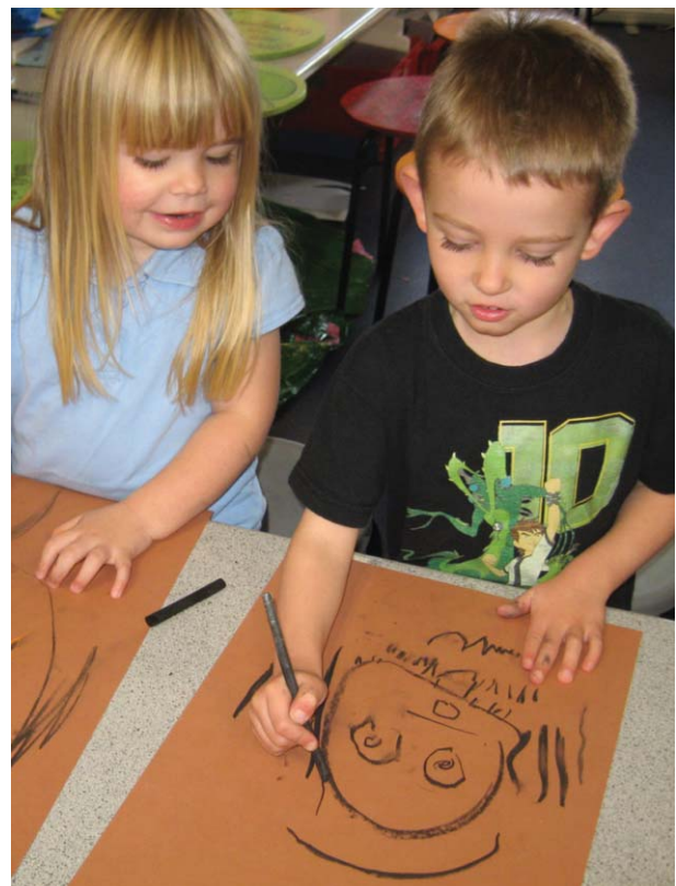
Hafod Primary School children studying sculpture and producing charcoal drawings

I believe that this report provides a clear picture of the advantages of such learning. We have teachers and artists who are ambitious to catapult Wales to the forefront of what threatens (or promises) to be a revolutionary transformation of educational systems in some of the more far-seeing countries of the world. Above all it is our children and young people who make this claim for Wales, one that we should honour with their Cymru Fydd in our mind. For their future, we cannot afford to be left behind.