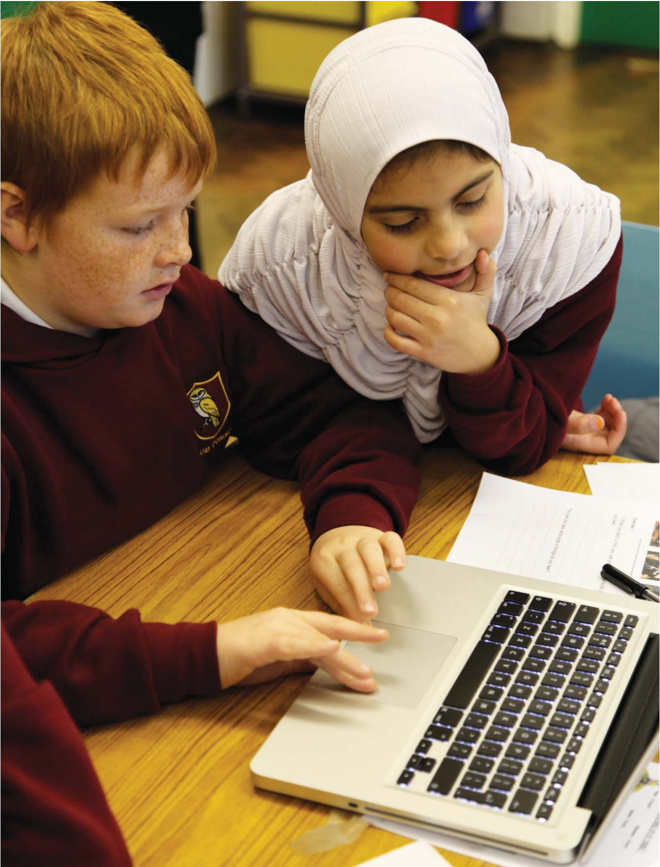
Film education workshop as part of Film Agency Wales' Film in Afan scheme