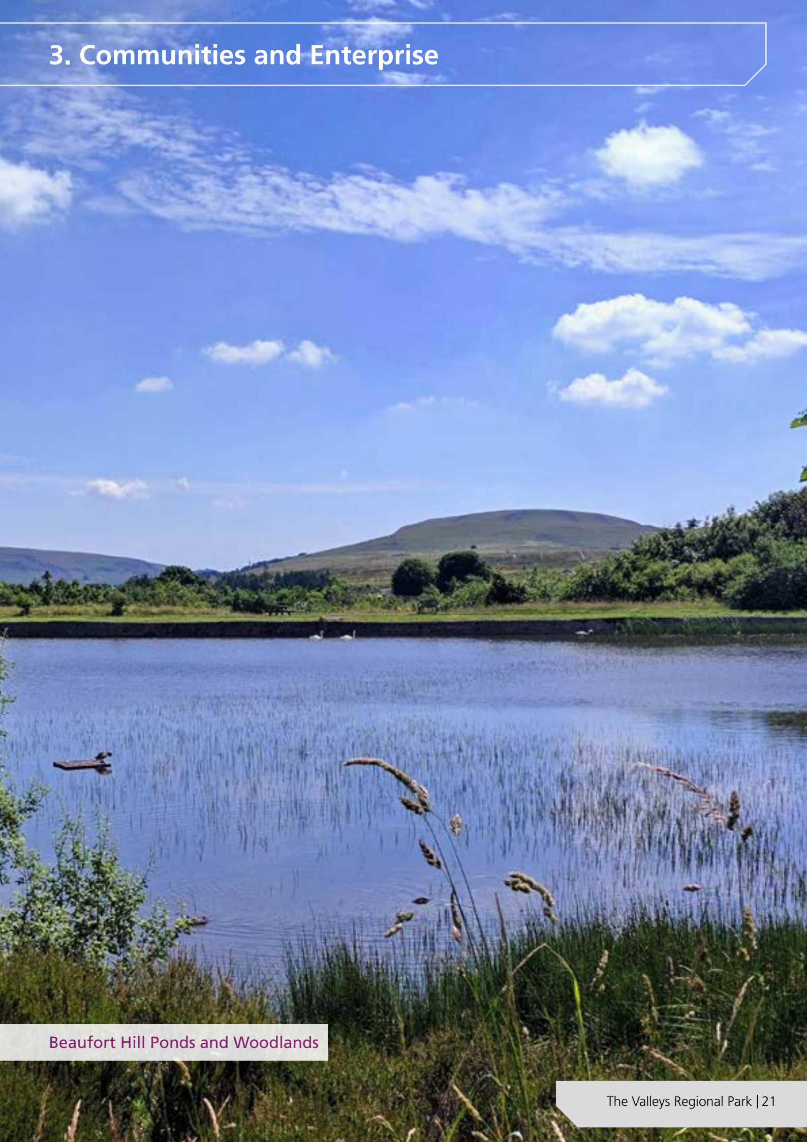
Beaufort Hill Ponds and Woodlands