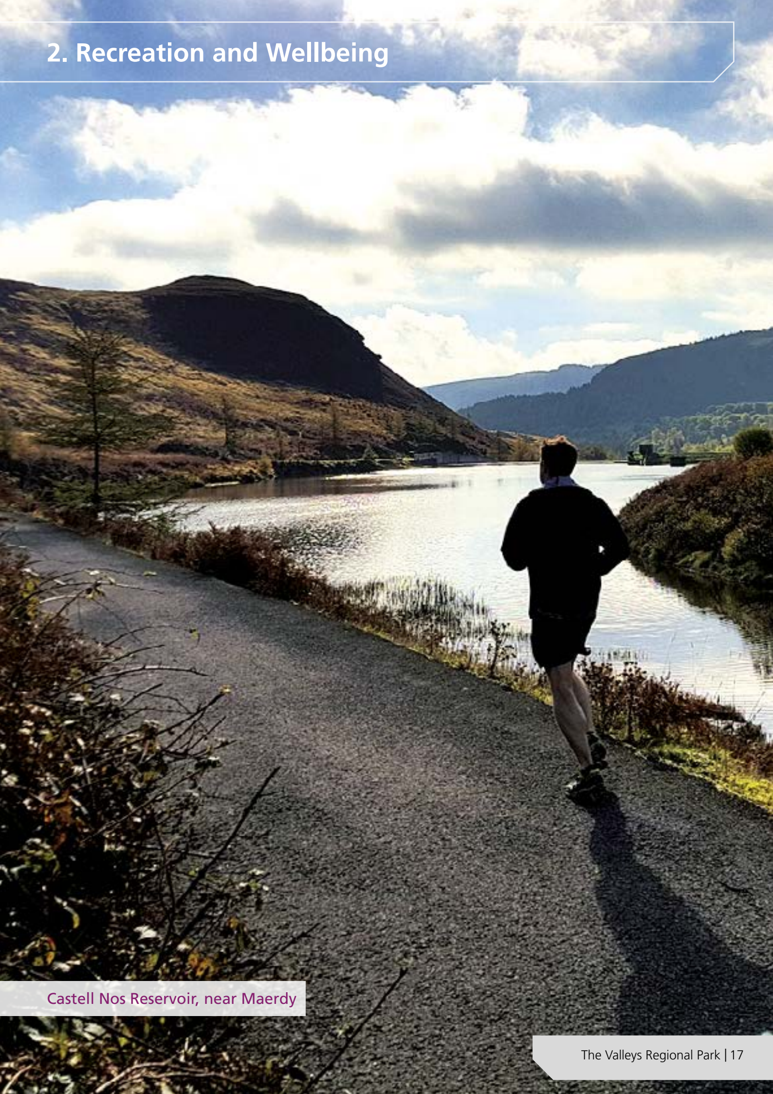
Castell Nos Reservoir, near Maerdy