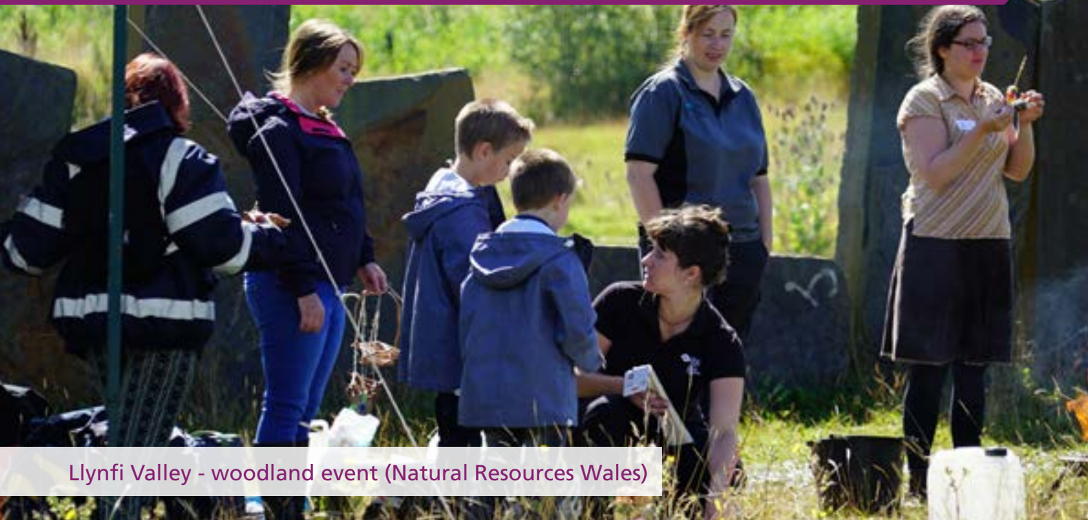
Llynfi Valley - woodland event (Natural Resources Wales)

The Valleys Regional Park will provide and sustain the improvement and management of a highly-visible network of uplands, woodlands, nature reserves and country parks, rivers, reservoirs and canals, heritage sites and attractions across the Valleys, linking with our towns and villages.