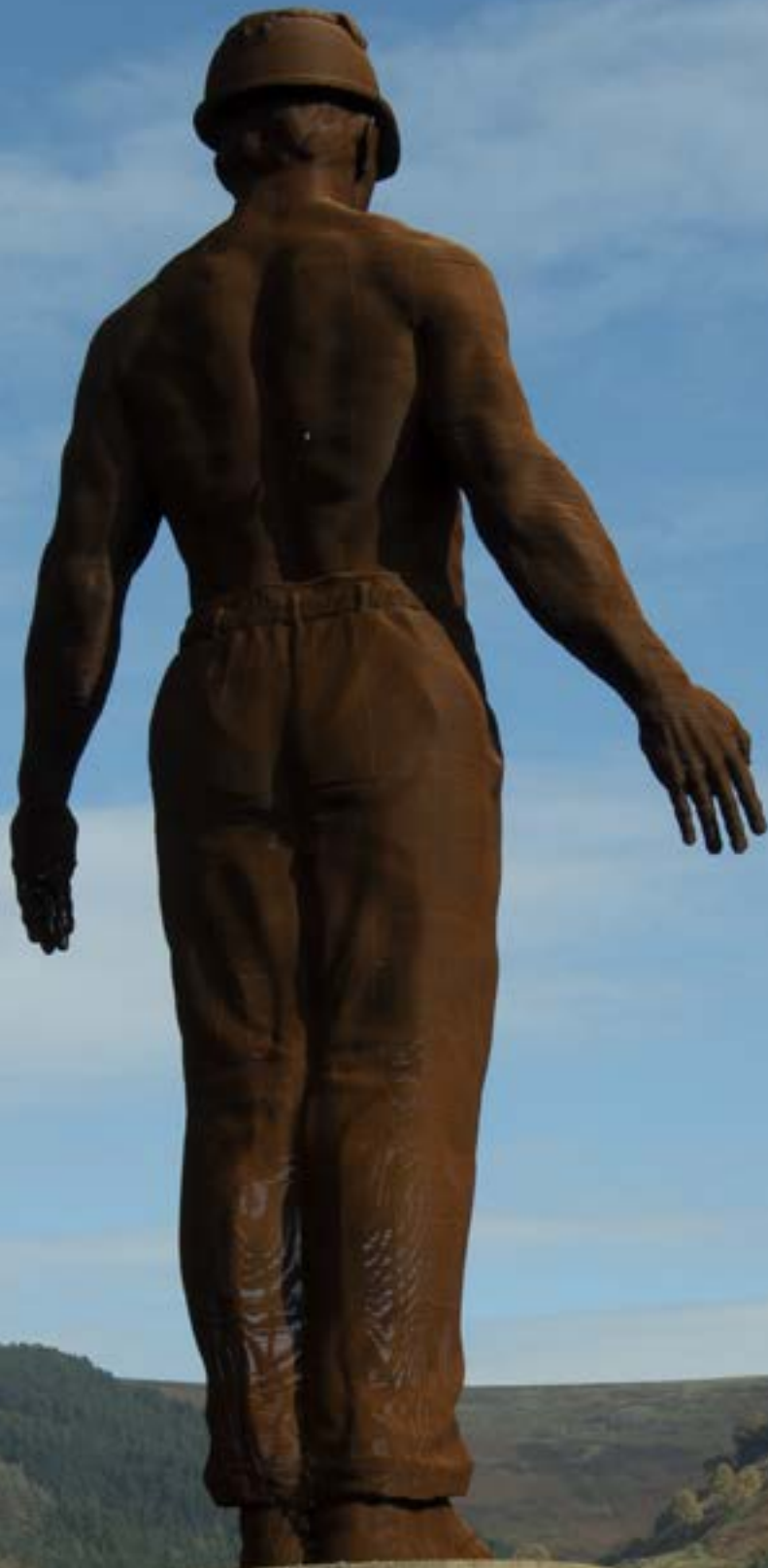
'Guardian' - Six Bells, Abertillery