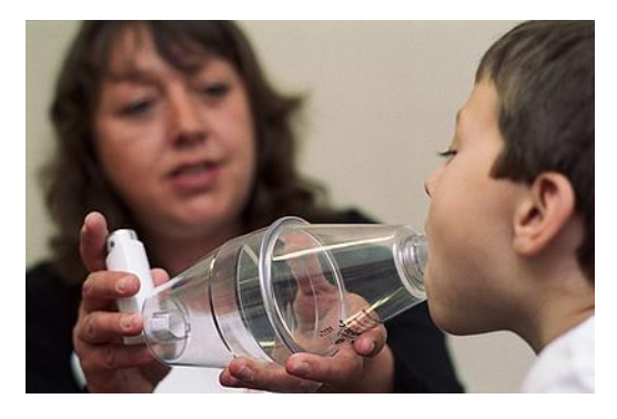
Fig. 1: a child being helped to use an inhaler with a spacer, for illustrative purposes only.

Younger children, or those who need assistance, may use a spacer device with their inhaler. A spacer is a plastic chamber with a mouthpiece at one end and a hole for the inhaler at the other. Spacers only work with an aerosol inhaler. Two deep breaths are taken per puff of the inhaler when using a spacer. It is important the spacer is the correct model for the inhaler. The community pharmacy which supplies the inhaler and spacer should make sure they are compatible.