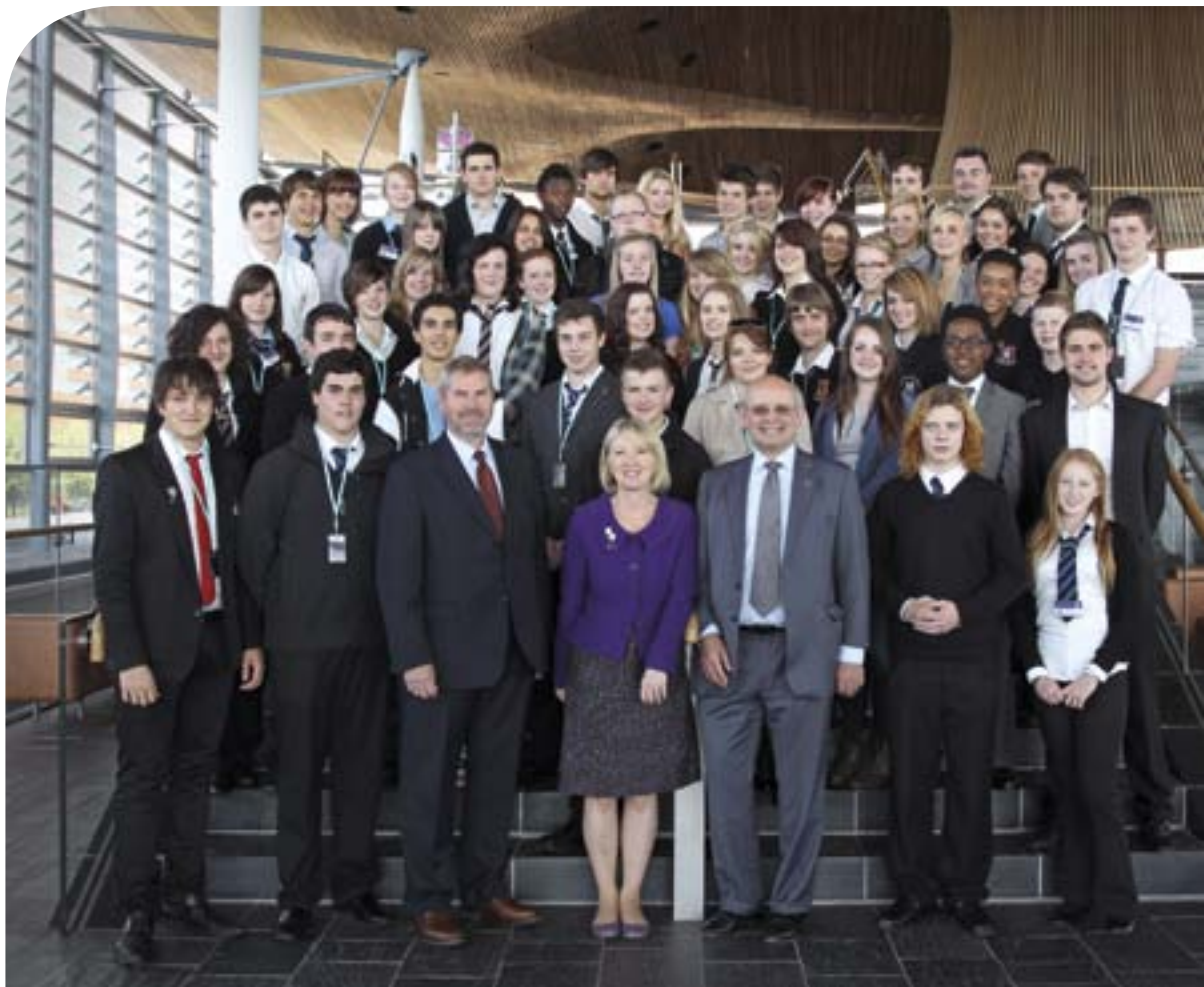
Participants in the Mock Council of the European Union 2011 event

The Welsh Government will implement and apply EU law in Wales relating to devolved responsibilities. We will continue to work closely with the UK Government, as the representative of the Member State, on developing and implementing legislation and dealing with any potential infractions.