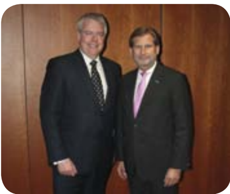
First Minister Carwyn Jones with European Commissioner for Regional Policy Johannes Hahn

We are committed to ensuring that Structural Funds allocated to Wales have maximum beneficial impact. We will support fewer and more strategic projects and it is our intention to focus on the delivery of sustainable growth and jobs.