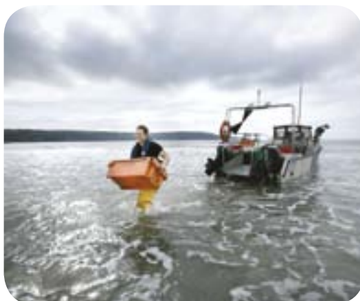
Dash Shellfish, Broadhaven, Pembrokeshire.

We aim to maximise the benefits of the funds available in Wales. We want to see future investment used for the development of fishing communities, innovation in areas including environmental protection, data collection, scientific research, aquaculture and the control of fishing operations.