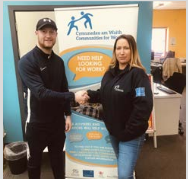
Army veteran JC received tailored one to one mentoring support from Communities for Work to gain a qualification and find employment