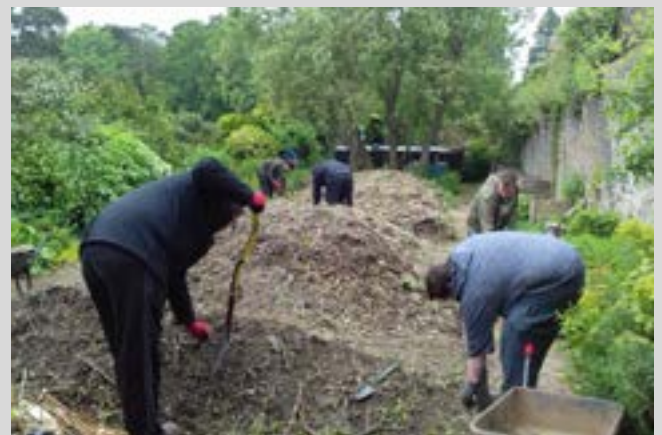
Growing Space's Learning to Grow project is supporting people with mental health conditions in South East Wales