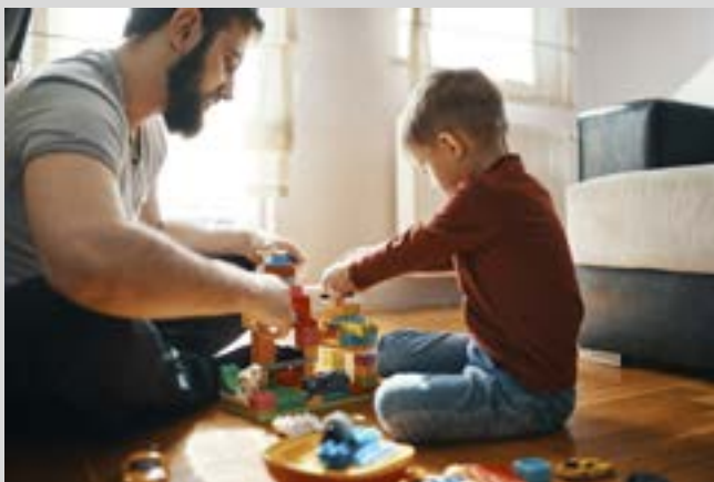
PaCE is assisting parents where childcare is a barrier to work