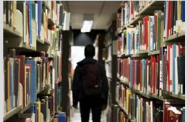
Newport Council's Skills@Work project is providing community-based learning opportunities for lower-skilled workers in South East Wales