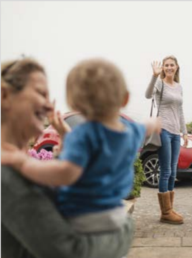
PaCE is assisting parents where childcare is a barrier to work