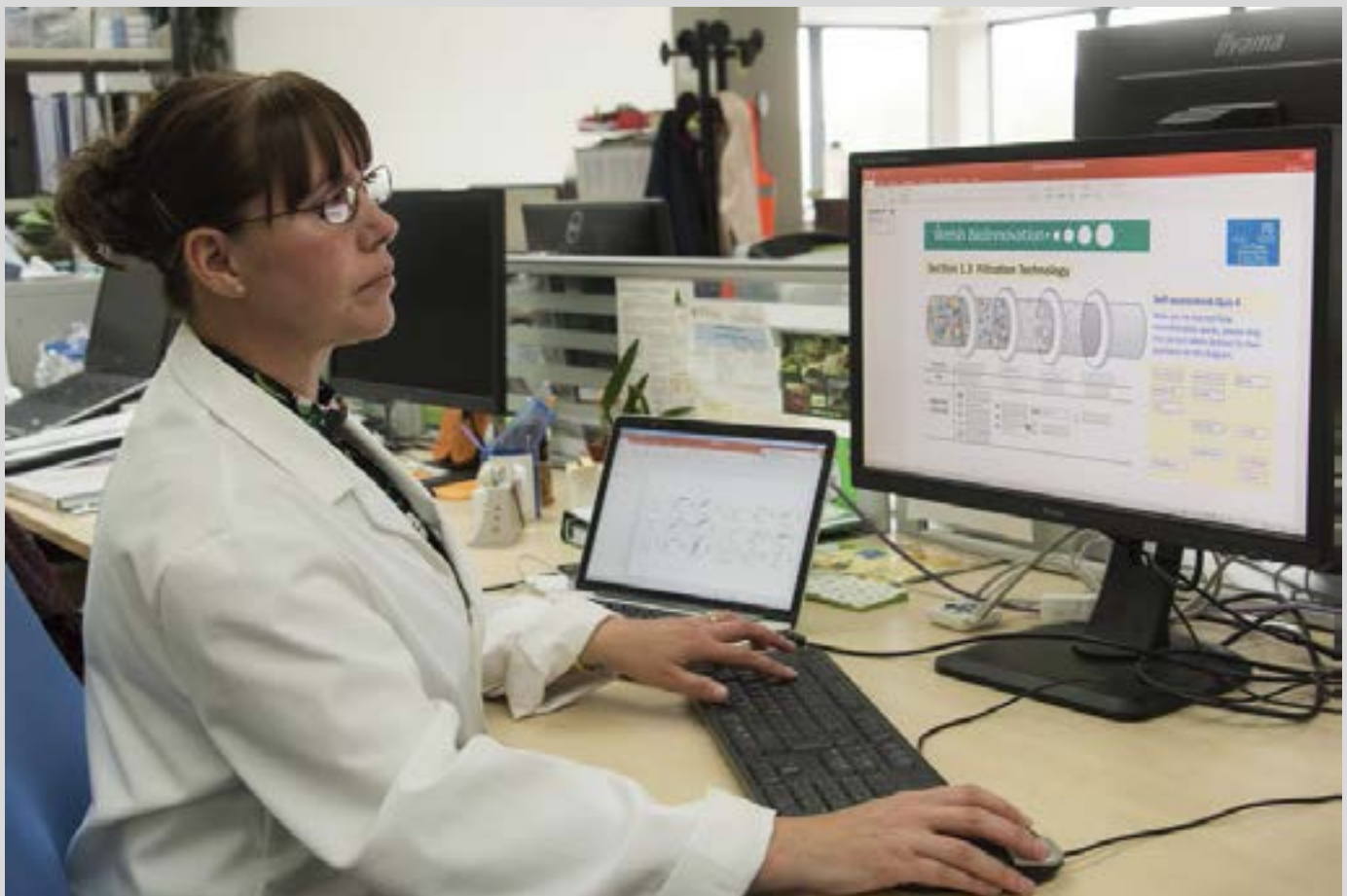
Aberystwyth University is delivering a bespoke skills and qualifications package for people working in the agri-food and biotech sector in East Wales