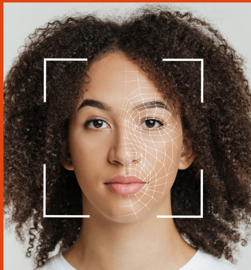
Facial recognition technology that recognises you by your face