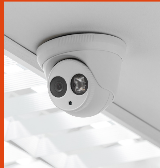
Live Facial Recognition Technology which uses cameras directed towards a specific area that can identify you