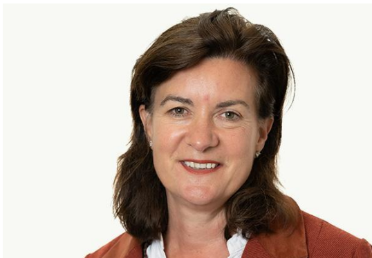
Eluned Morgan MS

I firmly believe that by accepting and implementing these actions, we will make a massive difference to the lives of people living with HIV and in protecting current and future generations from the virus.