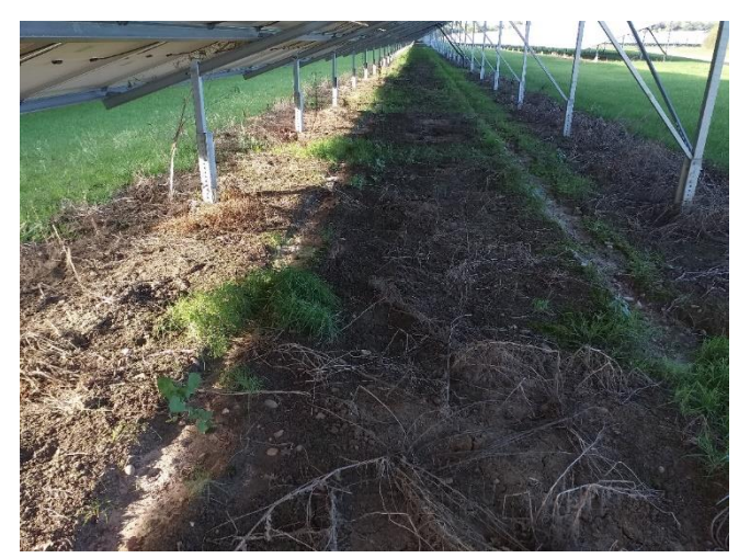
Figure 6: Channels created by panel runoff within 12 months of site operation commencing

Land between and underneath the PV panels is often grazed by sheep and where there are high numbers of sheep a solid compaction layer 2 cm to 6 cm over a wide area may result (Defra, 2021). There is likely to be some instances of run-off from the solar panels, which could result in the compaction of soils at the base of the panels (Choi et al,2020). Over time rivulets can form along the trailing edge of the panel with potential risk of soil erosion creating rills and gullies across the site. The sand bed could act as a drain, especially on heavy textured soils, leading to drainage discharges or wet patches at the down slope end of each trench.