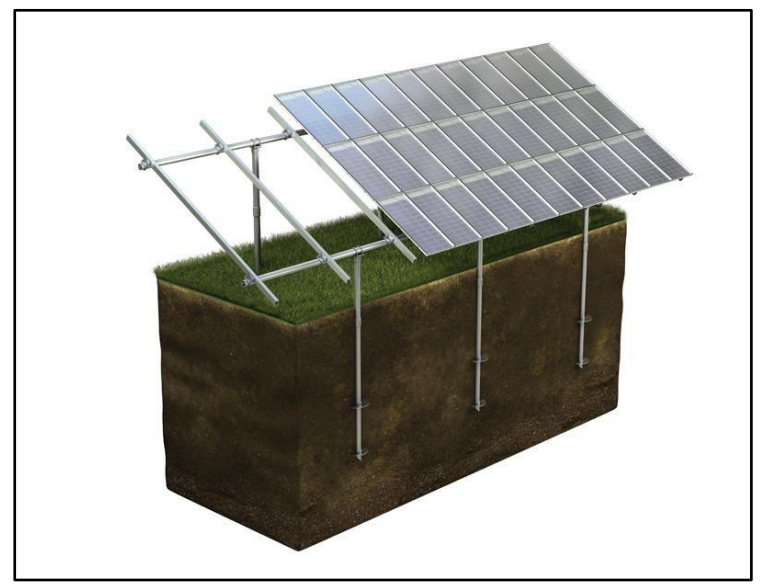
Figure 3 Helical piles at depth (Goliathtechpro.com)

H beams are used on larger scale developments as they have a stronger load bearing and require fewer penetrations per rack compared to helical anchors or ground screws.