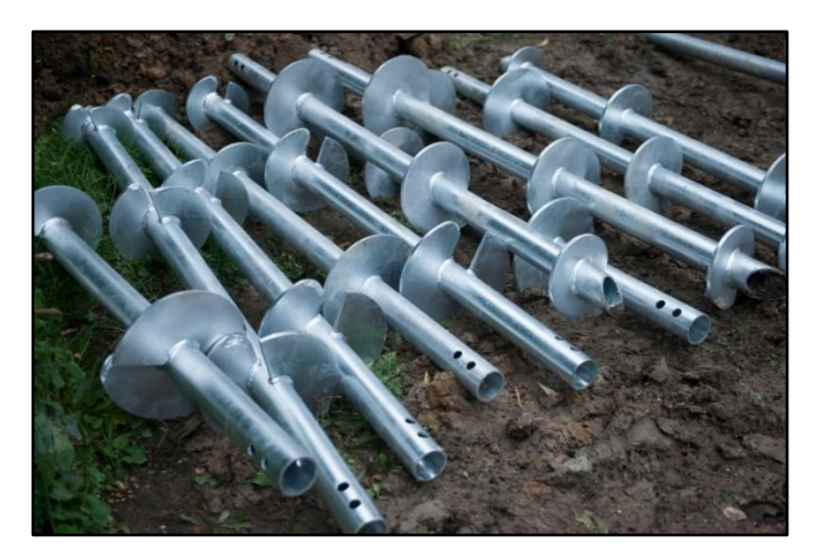
Figure 2: Helical beams