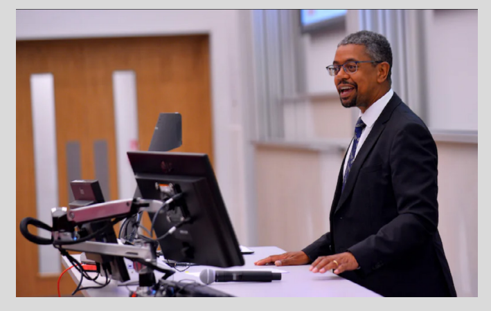
Minister for Economy attending Supercomputing Wales Symposium