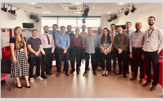
Data-Al Fast Track Graduates