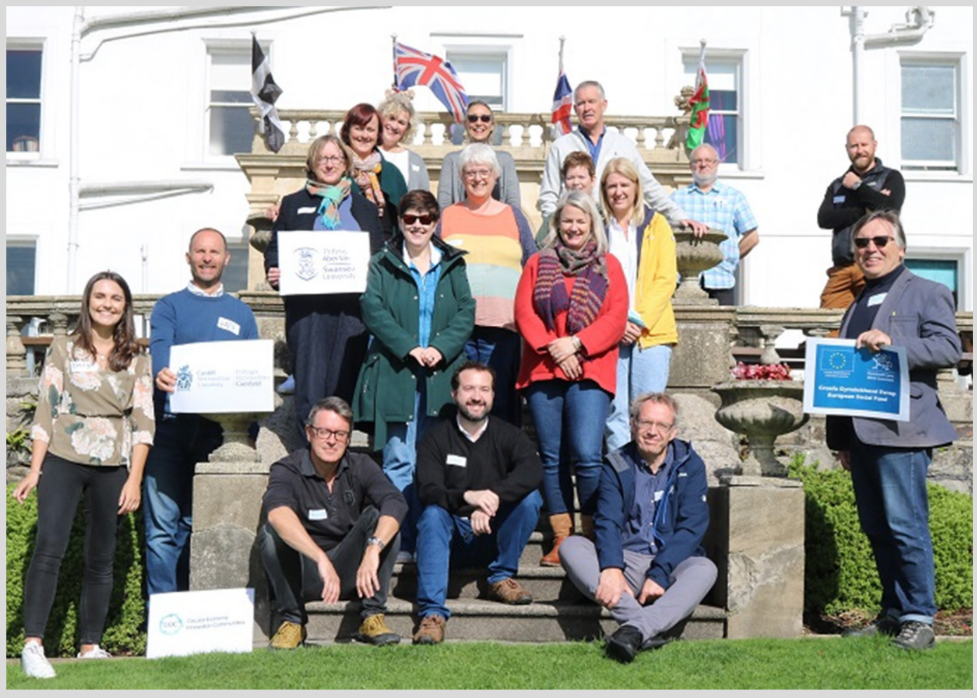
Participants of the Circular Economy Collaborative Innovation (CEIC) project

"The CEIC programme connected me with like-minded individuals who are passionate about integrating circular economy approaches into public services. I left it far more knowledgeable, both in regard to the effectiveness of social learning techniques, but also about how public servants in Wales can positively lead the way on sustainable development. It's not easy, but then who doesn't like a challenge!"