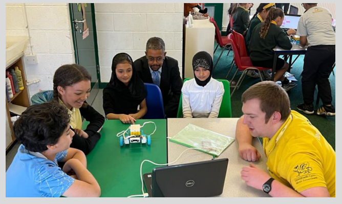
Minister for Economy attending a Technocamps workshop