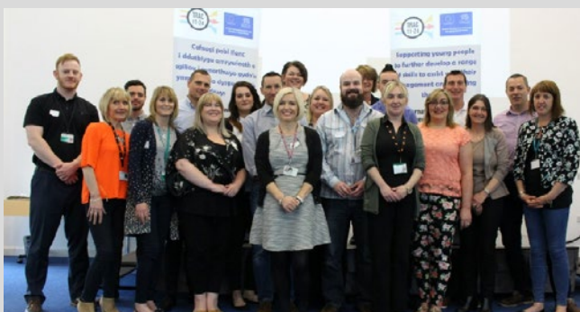
TRAC 11-24 team,