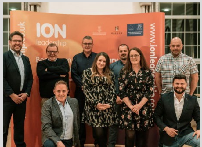
ION Leadership Graduates