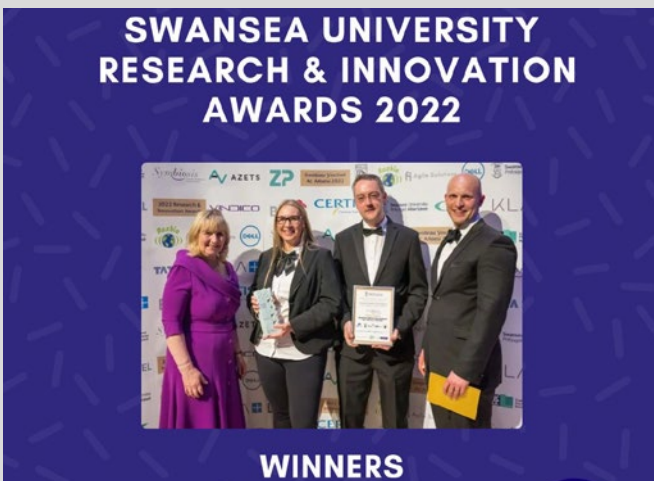
Science for Schools Scheme receiving the Outstanding Contribution to Public Engagement award