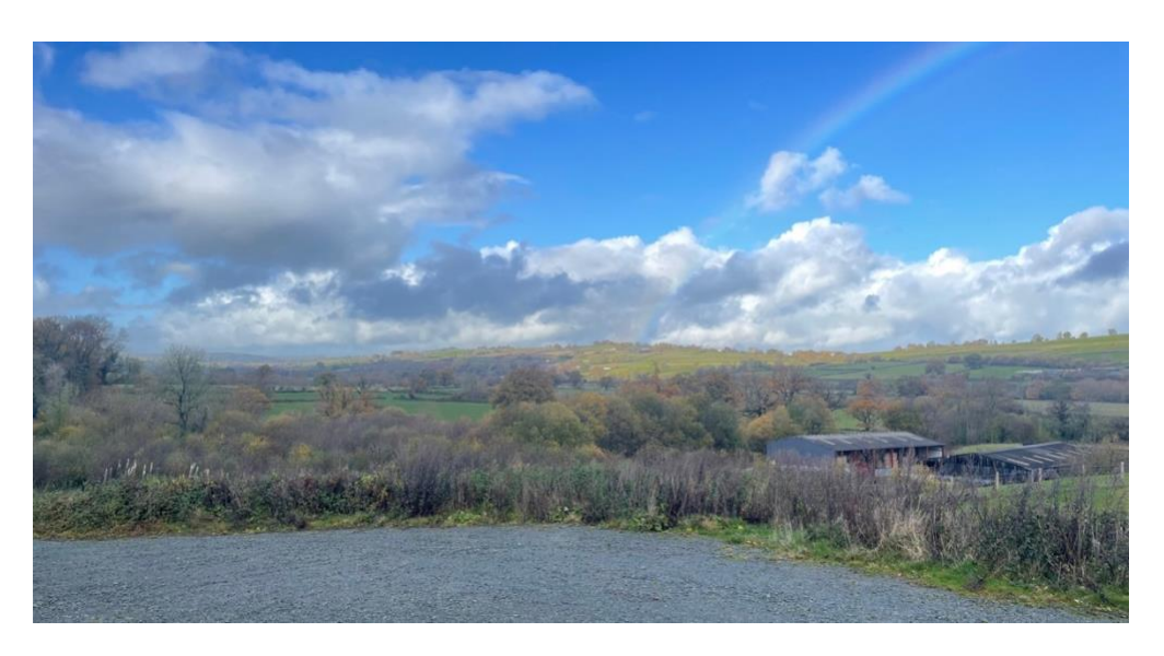
Figure 15. View towards the nest from the proposed viewpoint location.

Specialist guides would be required to lead public watches, and as such, it may be helpful to establish a voluntary group to support the delivery of this work (section 5.7). Alternatively, a partnership could be established with a local conservation or tourism organisation. As an example, North Wales Wildlife Trust run an Osprey viewpoint at Llyn Brenig, which is owned by Dŵr Cymru Welsh Water. A Friends of Usk Ospreys group is currently being set-up and this may provide a valuable source of highly-motivated volunteers. This would be an excellent way to engage the local community in activities at the farm and would replicate the situation at Glaslyn in North Wales, where the Osprey viewpoint is a community-led initiative run by Bywyd Gwyllt Glaslyn Wildlife, as described above.