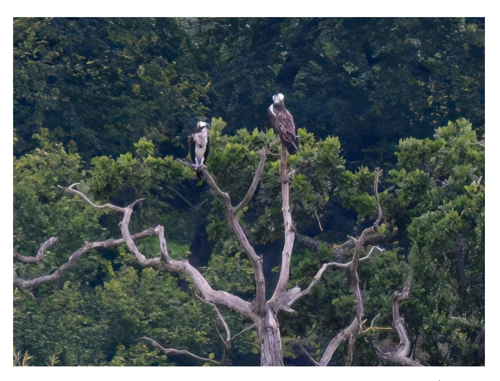
Figure 5. The Osprey pair (female on left) at Gilestone Farm on 28<sup>th</sup> August 2023.

The female was not seen after 28^{th} August, but the male remained at Gilestone Farm into early September, with the last sighting on 6^{th} .