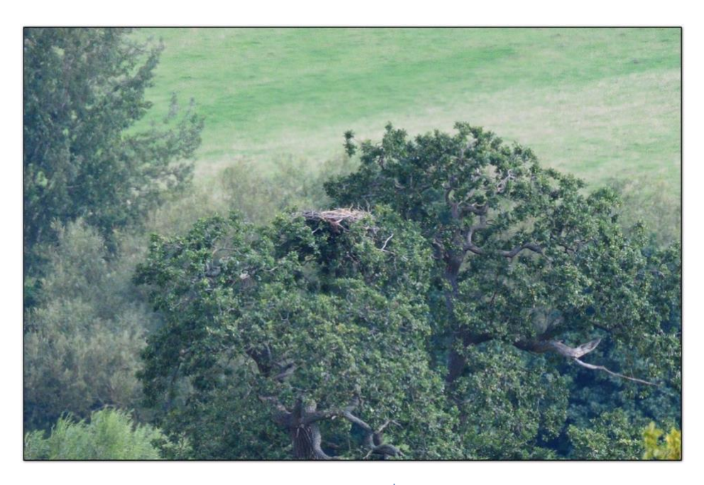
Figure 4. A view of the nest, taken on 26<sup>th</sup> August 2023.

The female was not seen after 28^{th} August, but the male remained at Gilestone Farm into early September, with the last sighting on 6^{th} .