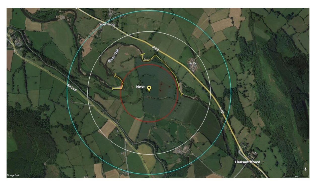
Figure 13. Zones around nest. Red = exclusion zone, white = restriction zone, blue = outer zone, yellow = no fishing zones.