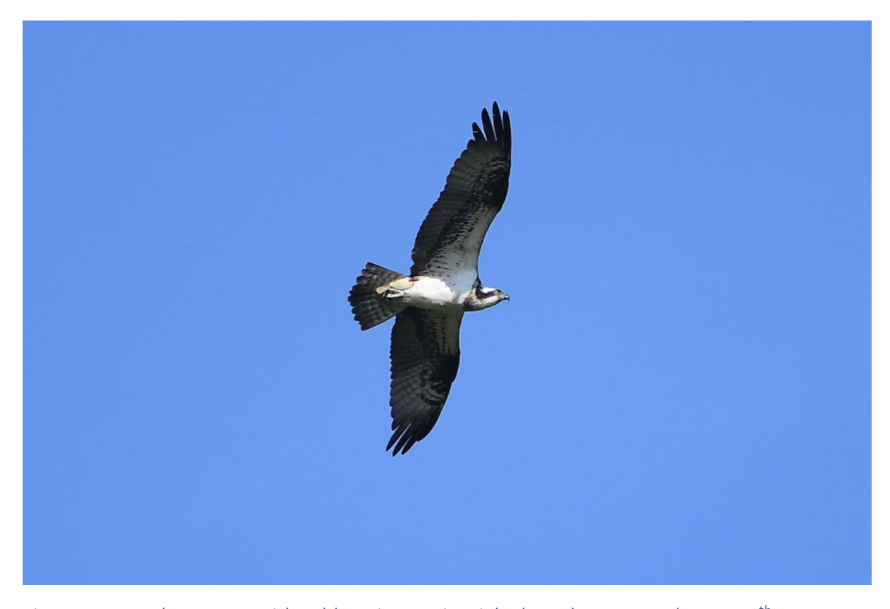
Figure 1. Female Osprey with a blue ring on its right leg, Llangorse Lake on 28<sup>th</sup> May 2023

In 2023 there were a total of ten sightings of Ospreys at Llangorse Lake during May, and another observation of a bird at Old Ford, Llanhamlach on 29<sup>th</sup> May. A female, photographed at Llangorse on 28<sup>th</sup> May, had a blue ring on its right leg. The colour rings currently used on Ospreys in the UK have a three-digit inscription, and although only the first digit and part of the second were visible on the best photo taken that day, this was sufficient to indicate it was likely to be one of two two-year-old females from Poole Harbour in Dorset which were seen in Wales during 2023 (Figure 1), and most likely 379, a female which was observed intruding at the Cors Dyfi nest in Mid Wales on 1<sup>st</sup> May. Two other Poole Harbour females bred successfully in Wales in 2023 and a third, 372, paired with a young male at a nest in North Wales.