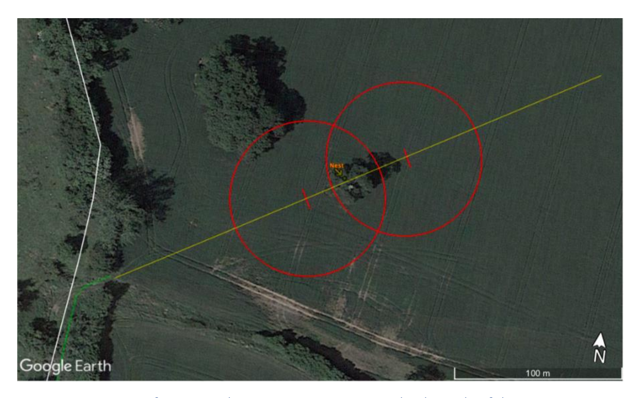
Figure 12. Location of intrusion detection cameras, situated either side of the nest tree.

Closed circuit television (CCTV) cameras are routinely fitted to Osprey nests both as a nest protection method, and as a public engagement tool. Live footage from other Osprey nests in Wales in the Glaslyn valley, at Cors Dyfi, Llyn Brenig, and Llyn Clywedog is streamed online to an audience of thousands and generates great interest. Climbing the tree to undertake remedial work would provide an opportunity to install such a system on the Gilestone Farm nest. It is recommended, therefore, that an application is made to NRW to undertake work to secure the nest, as detailed above, and to install a CCTV camera system. This application should be made before Christmas 2023 so that work can be undertaken prior to the Osprey's return in late March/early April 2024. It is recommended that the camera system enables footage to be viewed live, continuously recorded on site, and streamed online. In addition to the camera sited in the tree, a second wide-angle camera with pan-tilt-and-zoom capabilities should be located in the hedge immediately to the south of the nest tree. It will be important for both cameras to be accessible remotely, but with public live streaming from the nest camera only. [Edit – application sent to NRW on 21st December 2023.]