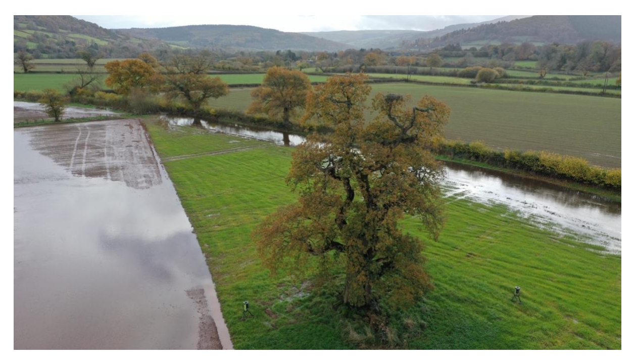
Figure 8. View of the nest and nest tree from a drone, November 2023