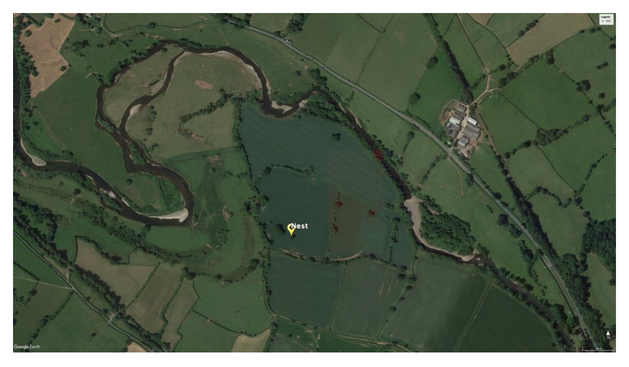
Figure 6. Aerial imagery showing the location of the nest, close to the River Usk.

The nest is located in the top of an oak tree situated in arable fields adjacent to the River Usk, in the North-West of the Gilestone Farm land holding (Figure 6 and Figure 7). The Ospreys were regularly observed foraging at Llangorse Lake, situated 1.6 miles to the north-east, and in the River Usk, during the course of summer 2023. Interestingly an artificial nest had been constructed in the same tree more than 15 years ago, in an effort to attract Ospreys into the area, but was not successful (A. King pers. comm. 2023). The structure was not maintained and was eventually blown out of the tree, leaving just a single timber support located approximately one metre below the natural nest built by the Ospreys in 2023. This is visible in Figure 9.