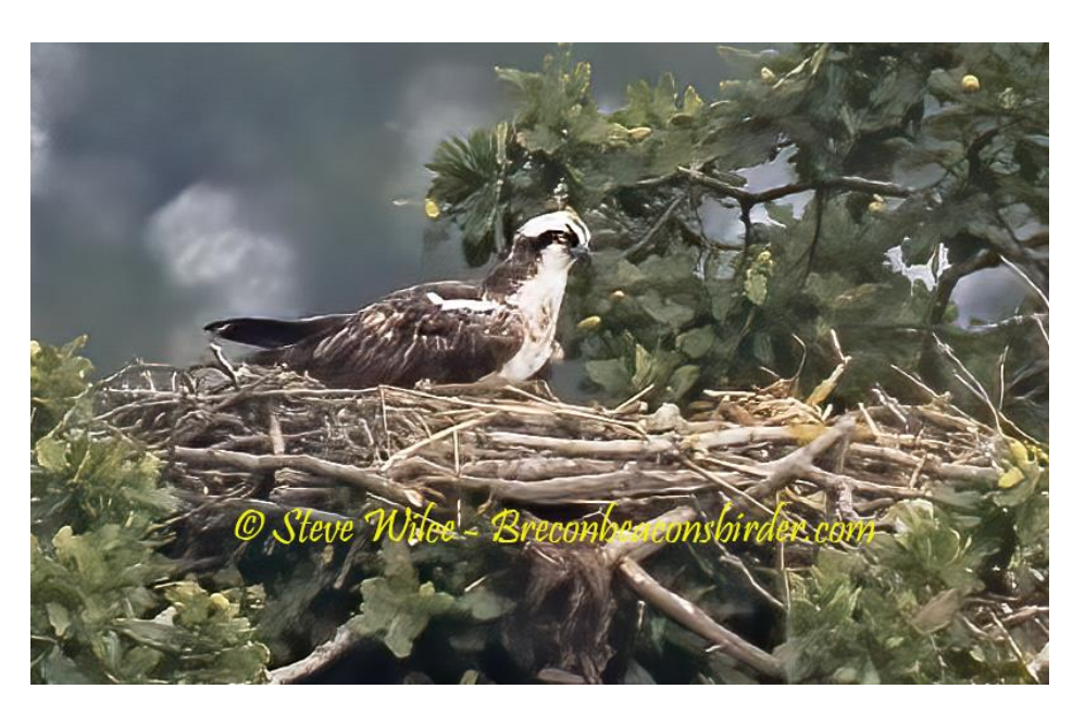
Figure 2. The unringed male perched on the nest.

month a significant structure had been constructed in the top of an oak tree near the river, by the Ospreys, with the majority likely undertaken by the male (Figure 2). This is the typical time of year for young Ospreys to build a nest.