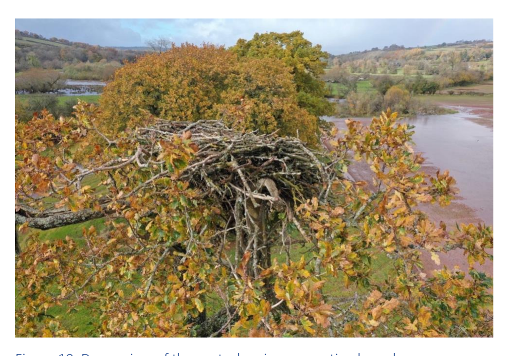
Figure 10. Drone view of the nest, showing supporting branches.