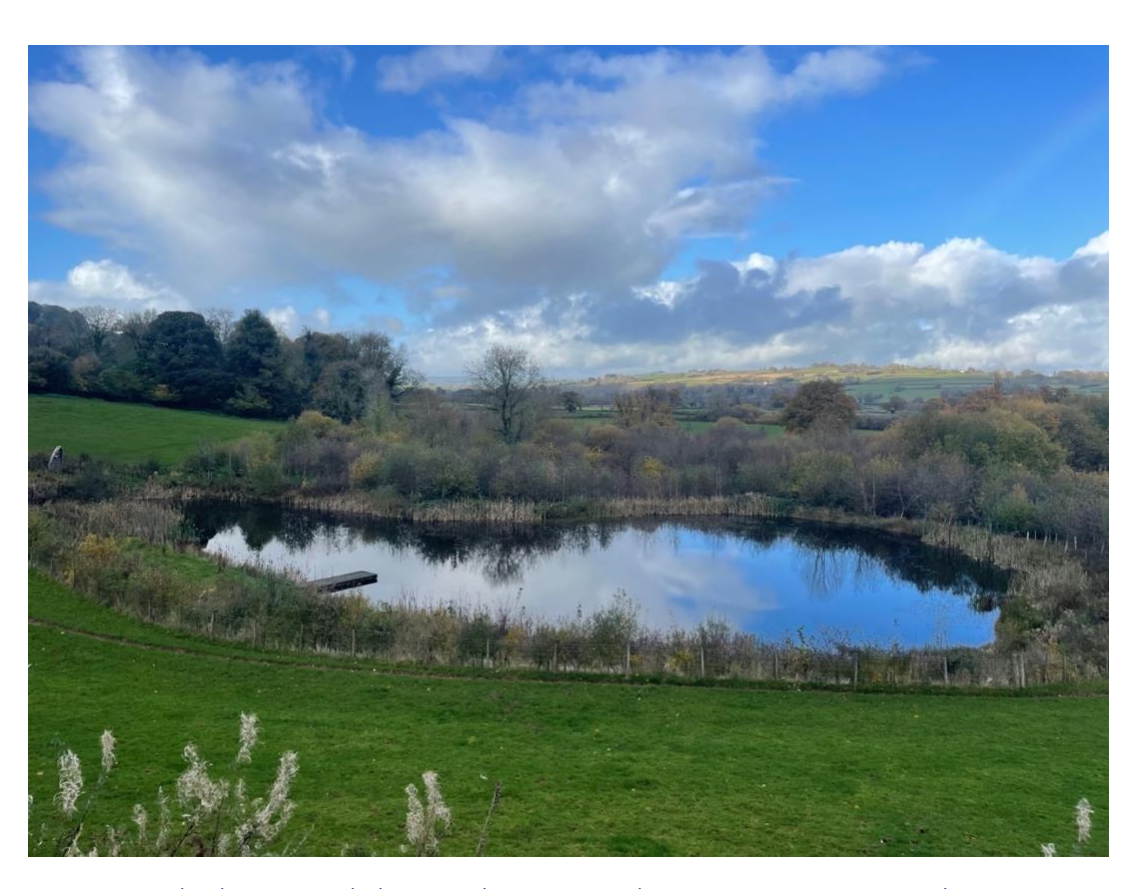
Figure 17. The large pond close to the proposed Osprey viewpoint at Gilestone Farm.

An added, longer-term possibility, is that a large pond, close to the proposed viewpoint, could be stocked with fish (Figure 17). Ospreys readily fish in water bodies of this size, and in some locations, special hides have been constructed to give very close views of hunting Ospreys. In Rutland a photography hide at Horn Mill Trout Farm has proved hugely successful and has become a key element of the trout farm's business model, with photographers paying £87 for a dawn or evening session in the hide which can accommodate up to six people (<a href="https://www.rivergwashtroutfarm.co.uk/horn-mill-osprey-hide/">https://www.rivergwashtroutfarm.co.uk/horn-mill-osprey-hide/</a>).