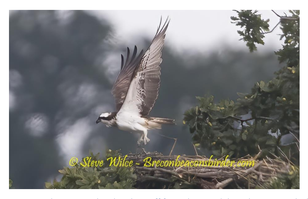
Figure 3. The unringed male taking off from the nest.

The two birds remained in the vicinity of the nest at Gilestone Farm for the remainder of the summer and were also frequently seen at Llangorse Lake. The nest visibly grew in size during July and August (Figure 4) and the two birds were still present together on 28<sup>th</sup> August, when they were photographed in a dead tree near the nest (Figure 5).