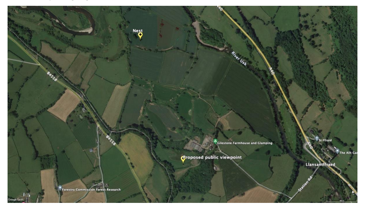
Figure 14. Location of proposed public viewpoint site at Gilestone Farm.

The proposed CCTV system would enable live images from the nest to be shown close to the viewpoint, using a large screen television that could be sited in one of the existing farm buildings nearby. Visitors could be given a short introductory talk at this location, before proceeding to the viewpoint. It would be advisable to provide a temporary shelter, such as a gazebo, so that those viewing the nest are protected from any inclement weather. A more permanent structure could follow in due course if public watches prove successful. Hard standing nearby would provide some limited all-weather parking (Figure 16).