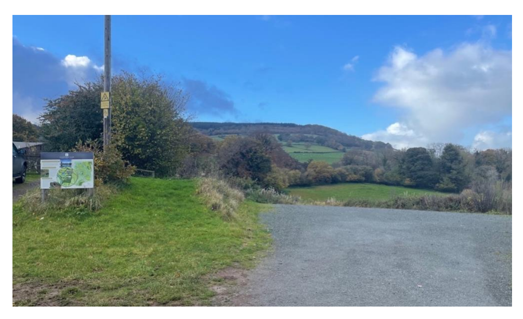
Figure 16. The proposed viewpoint location.