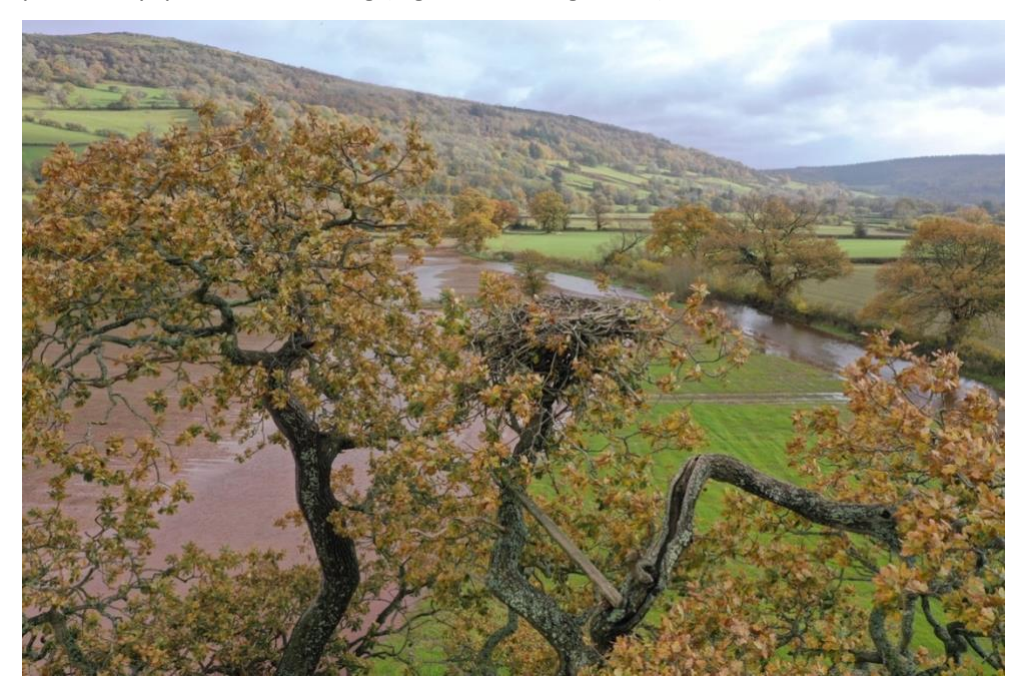
Figure 9. Drone view of the nest with last remaining timber support from original artificial nest just visible.

On 14<sup>th</sup> November, over two months after the Ospreys left the site, a visual inspection of the nest was caried using a drone. Almost all of the structure was still intact despite recent heavy rain and strong winds, but it was noted that the branches supporting the nest appeared relatively weak and, potentially, prone to breaking (Figure 9 and Figure 10).