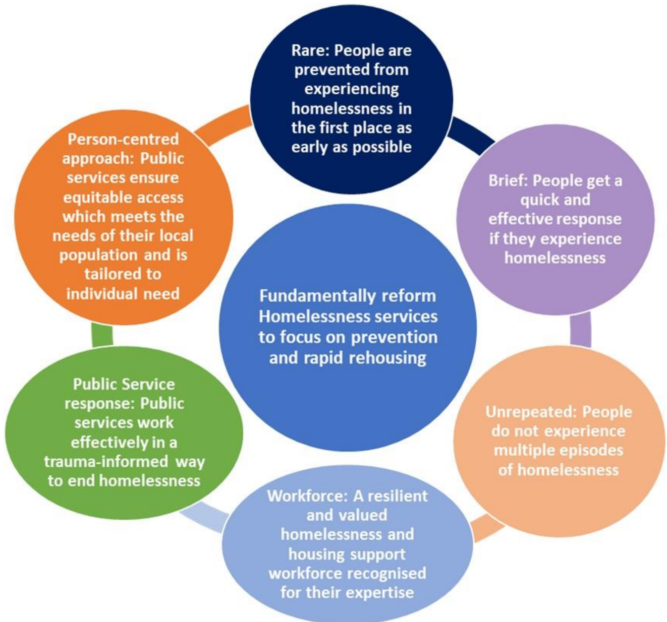
Diagram 1: Strategic outcomes

Table 1 below provides the rationale for each Strategic Outcome and how each aligns with the Ending Homelessness Action Plan.