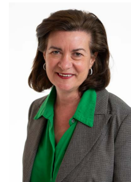
Eluned Morgan MS First Minister of Wales

Let us move forward with determination and optimism, knowing that our collective efforts will help create a more just, anti-racist and equitable society for all.