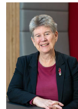
Jane Hutt MS Cabinet Secretary for Social Justice, Trefnydd and Chief Whip