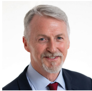
Huw Irranca-Davies MS DEPUTY FIRST MINISTER AND CABINET SECRETARY FOR CLIMATE CHANGE AND RURAL AFFAIRS