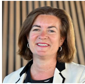
Rt Hon Eluned Morgan MS FIRST MINISTER OF WALES