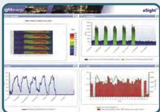
Figure 1: Carbon Management in the Administrative Estate

Carbon Management across the Welsh Government Administrative Estate