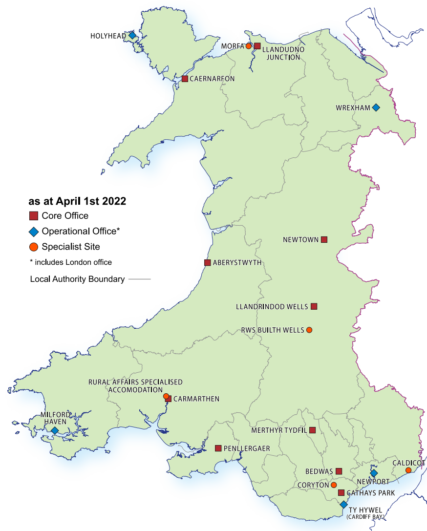
Figure 1: Location of core Welsh Government Offices