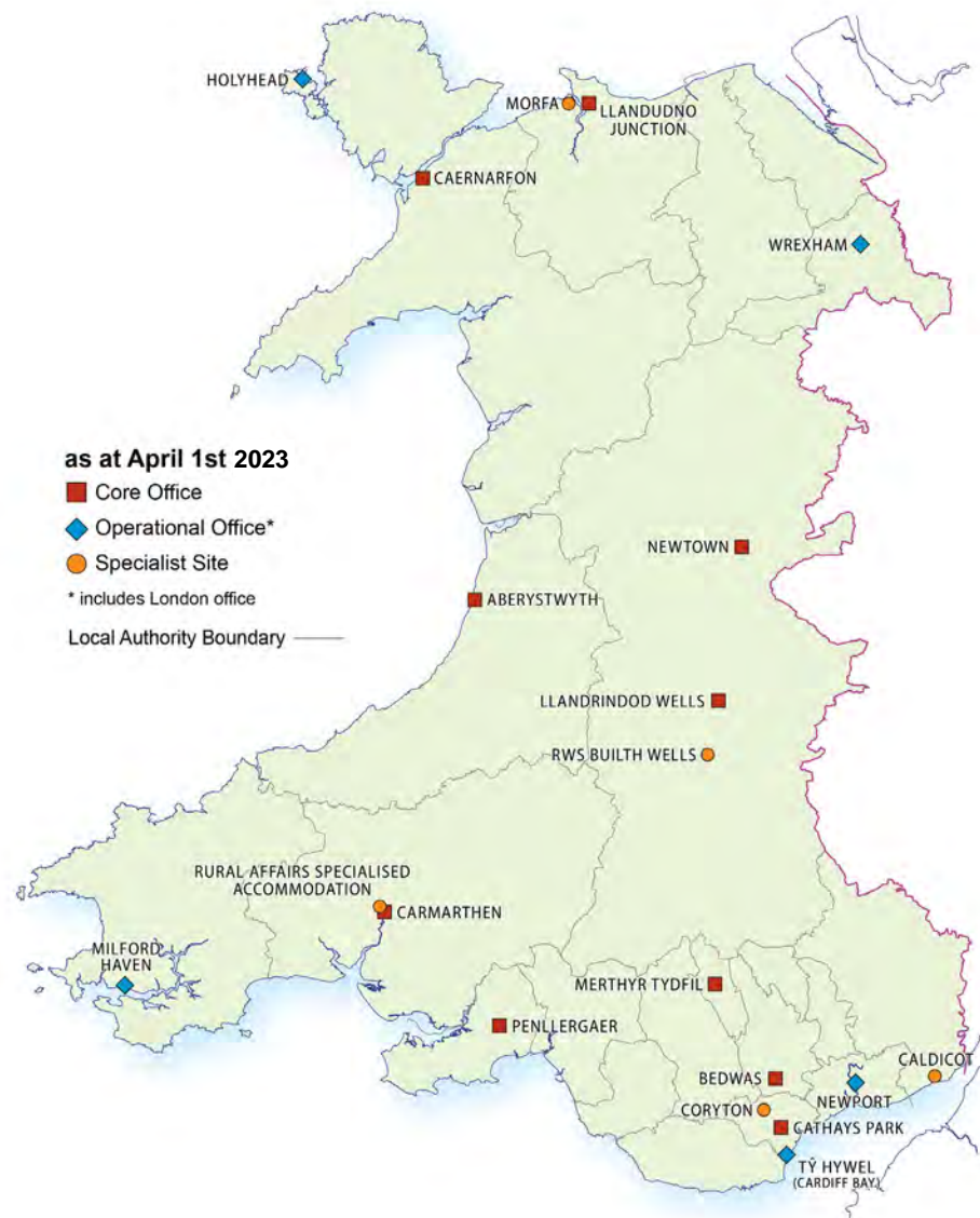
Figure 1: Location of Administrative Estate Offices