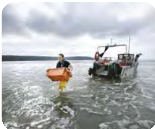
Dash Shellfish, Broadhaven, Pembrokeshire.

We aim to maximise the benefits of the funds available in Wales. We want to see future investment used for the development of fishing communities, innovation in areas including environmental protection, data collection, scientific research, aquaculture and the control of fishing operations.