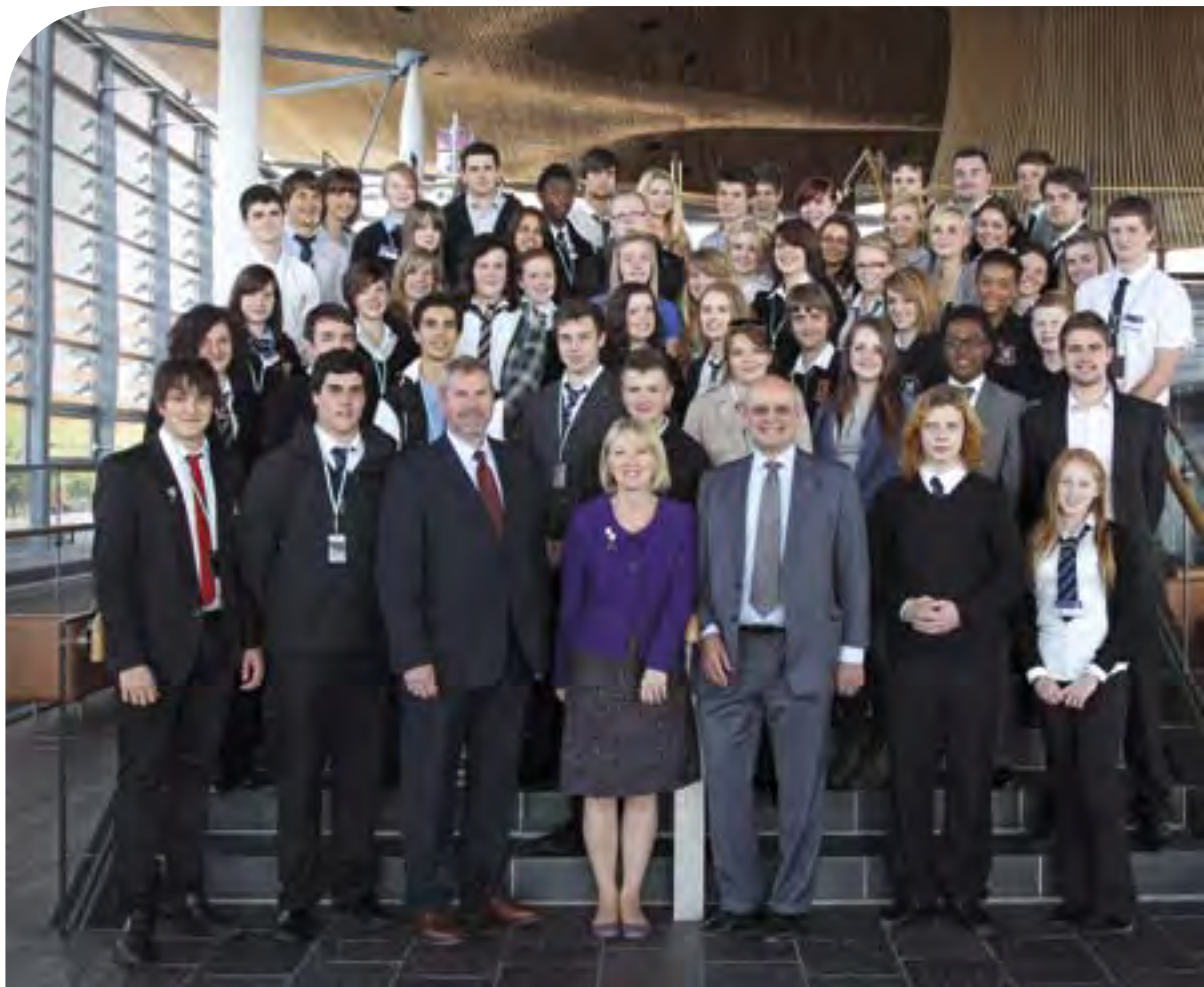
Participants in the Mock Council of the European Union 2011 event

The Welsh Government will implement and apply EU law in Wales relating to devolved responsibilities. We will continue to work closely with the UK Government, as the representative of the Member State, on developing and implementing legislation and dealing with any potential infractions.