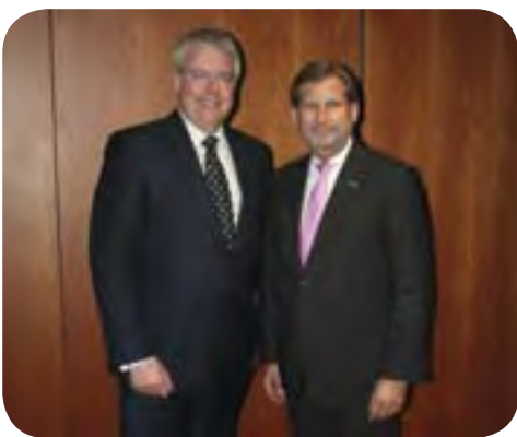
First Minister Carwyn Jones with European Commissioner for Regional Policy Johannes Hahn

We are committed to ensuring that Structural Funds allocated to Wales have maximum beneficial impact. We will support fewer and more strategic projects and it is our intention to focus on the delivery of sustainable growth and jobs.