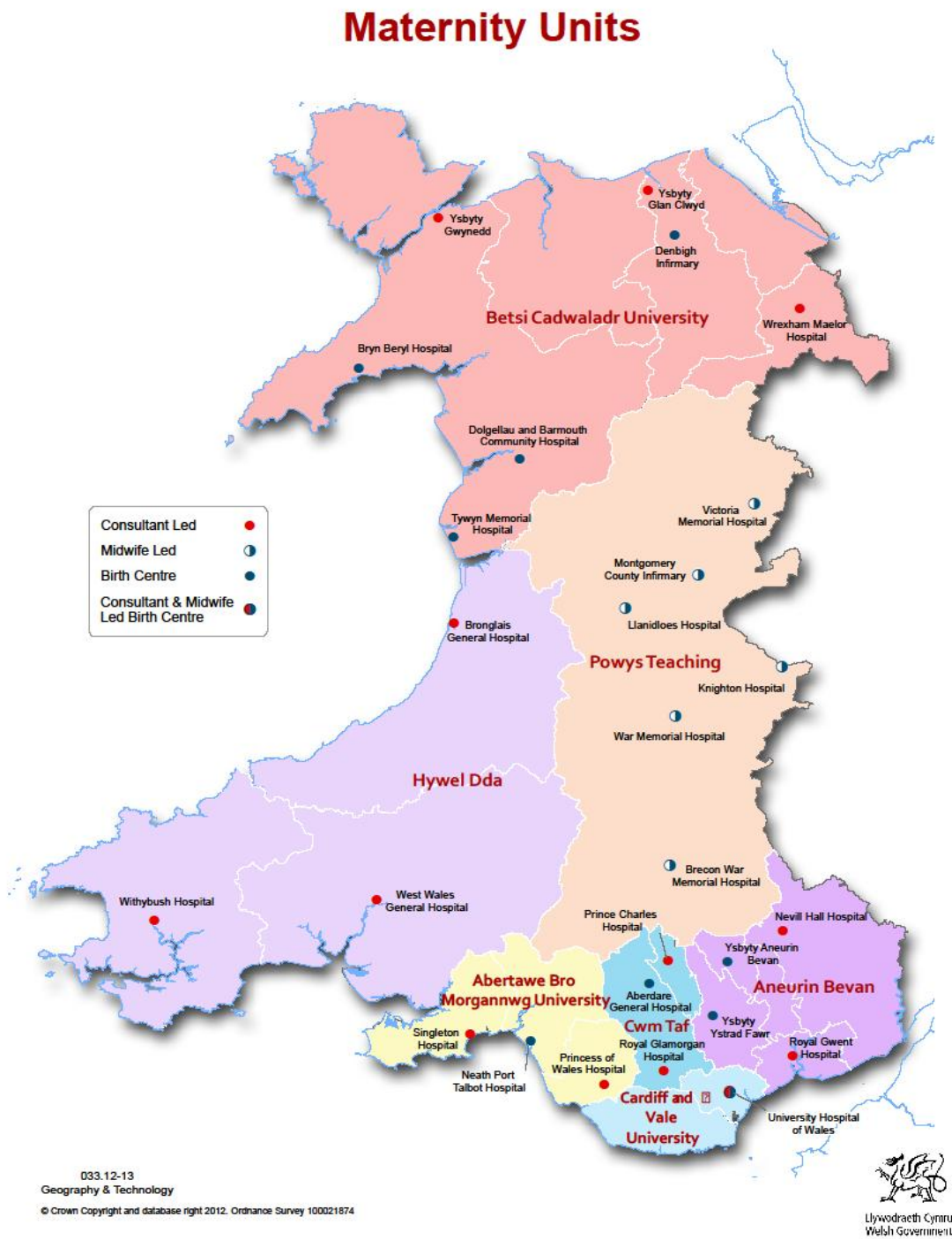
Figure 5.1 Map of Maternity Facilities across Wales